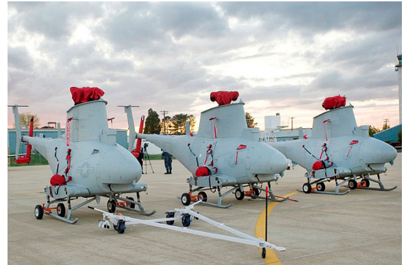
Northrop Grumman MQ-8 Firescout Plugs and Covers