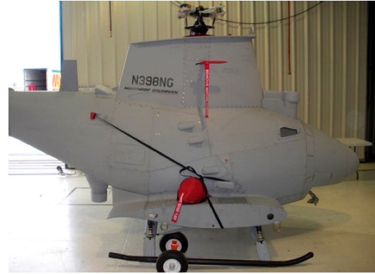
Covers & Plugs for the Northrop Grumman MQ-8 Fire Scout