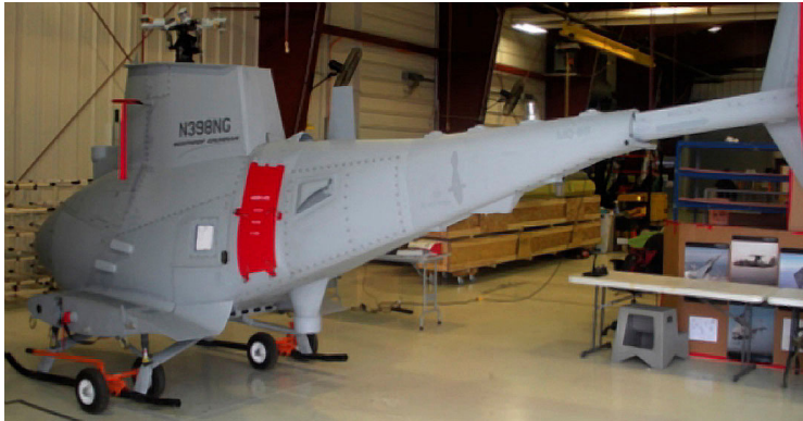
Covers & Plugs for the Northrop Grumman MQ-8 Fire Scout

necessary. Engine plugs have 'Remove Before Flight' streamers sewn onto the face of the plugs. Most plugs are imprinted with the aircraft registration number in black for an extra charge. Storage bag NOT included. Engine plugs may be inserted after flight when the engine is still warm. Engine Inlet Plugs are commonly referred to as Cowl Plugs, Intake Plugs, Cowl Blocks, Engine Blocks, and Engine Bunges.