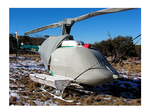
JetRanger Bubble, Engine, Rotor Hub & Blade Covers (& Tie-Downs)