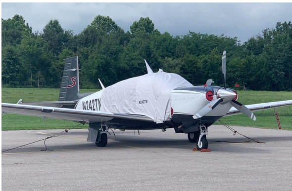
Mooney M20TN Extended Canopy Cover

This cover type is made from Silver Acrylic Sunbrella canvas and is 100% lined with a soft and smooth microfiber. Bruce's Custom Covers developed this material combination especially for aircraft protection. The outer material is medium weight and treated for water resistance, UV resistance and anti-static buildup. The inner lining is a very soft and smooth microfiber to prevent scratching. The material is very reflective, and tests show that the cabin interior temperature can be reduced to near-ambient temperature on the hottest of days. It is water, ice and snow repellent, yet breathable to allow moisture to escape from between the cover and the aircraft surface.