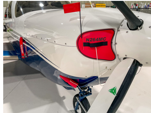
Mooney M20M Engine Inlet Plugs (Bravo Model) (set of 4)