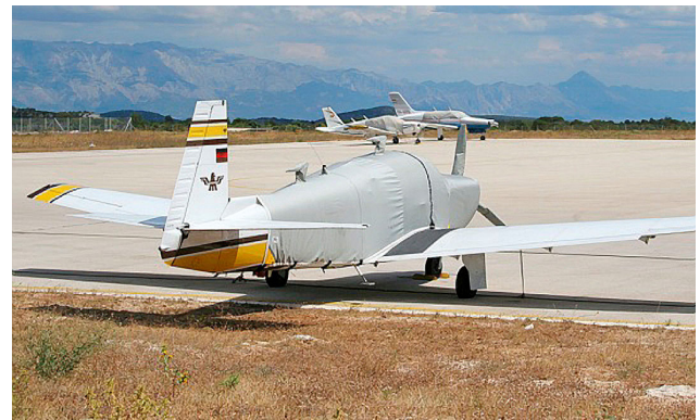
Mooney Extended Canopy/Engine Cover