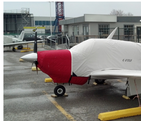
Mooney 201 Insulated Engine Cover, fully enclosed