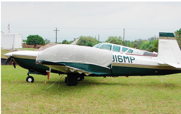
Mooney Ovation Canopy Cover

This cover type is made from Silver Acrylic Sunbrella canvas and is 100% lined with a soft and smooth microfiber. Bruce's Custom Covers developed this material combination especially for aircraft protection. The outer material is medium weight and treated for water resistance, UV resistance and anti-static buildup. The inner lining is a very soft and smooth microfiber to prevent scratching. The material is very reflective, and tests show that the cabin interior temperature can be reduced to near-ambient temperature on the hottest of days. It is water, ice and snow repellent, yet breathable to allow moisture to escape from between the cover and the aircraft surface.