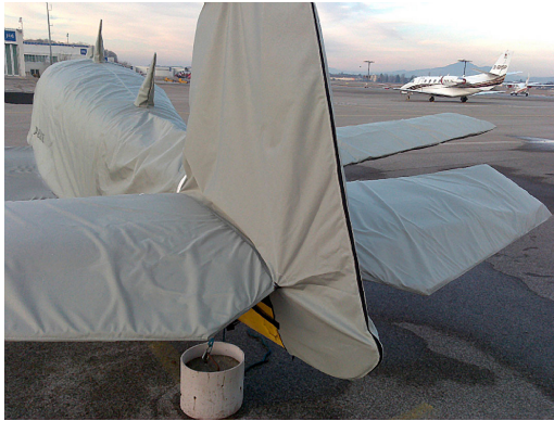
Mooney 231 Full Cover Set: Extra Extended Canopy/Engine Cover, Wing Covers, and Empennage Cover

WINTER USE MATERIAL - Made with Solution-Dyed Polyester fabric, this option is intended for seasonal use to aid in deicing, rain mitigation, or for occasional travel. The material is lighter and more compact, but more susceptible to UV damage and may have a shorter useful life if used continuously outside than the all-year use material.