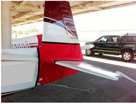
Mooney Tailcone Cover, completely enclosed