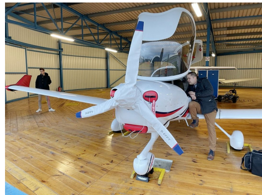
DA40 NG Engine Plugs