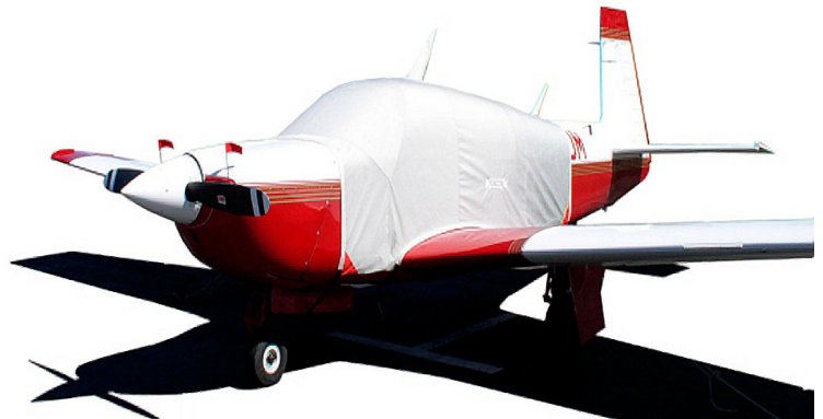
Mooney Extended Canopy Cover & Engine Plugs