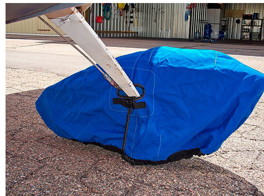
Bellanca Citabria Wheelpant Cover