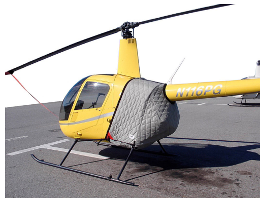
Robinson R-22 Insulated Engine Cover (also covers bottom) & Front Blade Tie-down