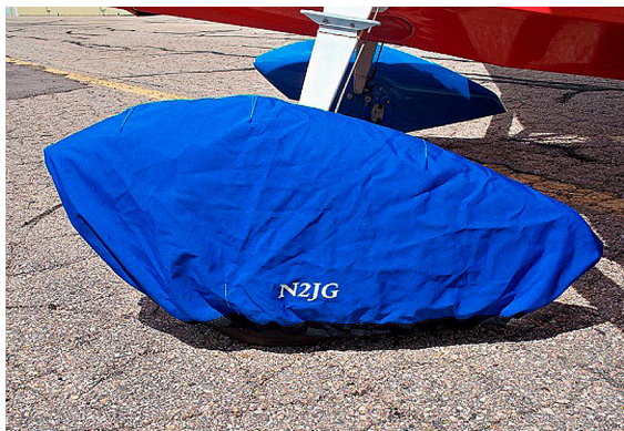
Bellanca Citabria Wheelpant Cover

ALL-YEAR USE MATERIAL - Made with Silver Acrylic Sunbrella canvas, the all-year use material is the best option for sun protection and cover longevity. This heavier more durable material is intended for all weather conditions, such as rain and snow or lots of sun.