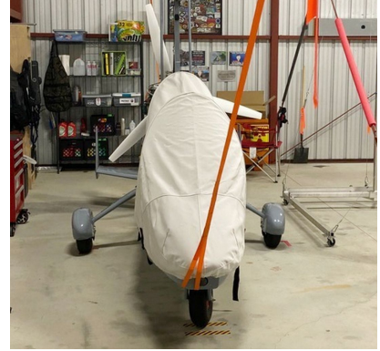
Magni Auto Gyro M16 Cockpit/Nose Cover