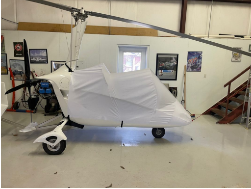
MTO Sport Gyrocopter Canopy/Nose Cover, test fit cover

Travel Covers are made with Silver Solution-Dyed Polyester fabric and fully lined over the entire cover. The material is lightweight and more compact for easy stowage in the aircraft. The polyester material is water resistant, but only intended for occasional use outside. We also have an ultra lightweight material available for fitted hangar dust covers. For daily outdoor use, the non-travel Sunbrella Cover is the best choice.