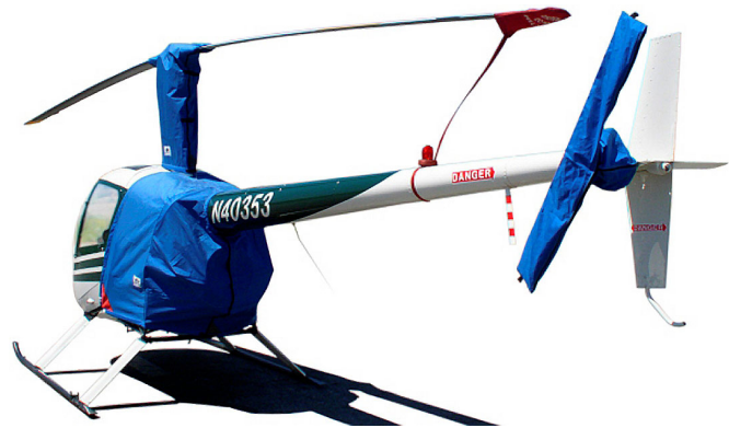
Robinson R-22 Engine, Rotor Mast & Tail Rotor Covers, with Blade Tie-down