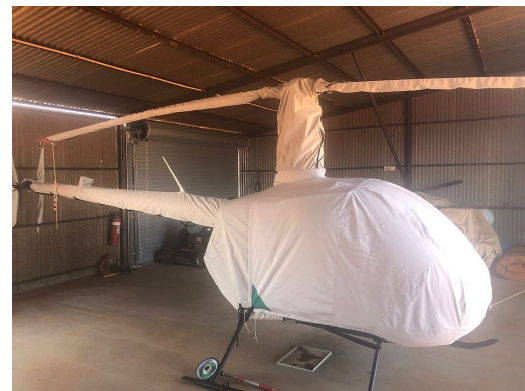
Robinson R-22 Full Cover Set