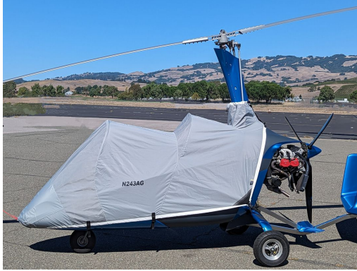
Autogyro MTOSPORT Travel Cover, Light Weight Canopy/Nose Cover

Travel Covers are made with Silver Solution-Dyed Polyester fabric and fully lined over the entire cover. The material is lightweight and more compact for easy storage in the aircraft. The polyester material is water resistant, but only intended for occasional use outside. We also have an ultra lightweight material available for fitted hangar dust covers. For daily outdoor use, the non-travel Sunbrella Cover is the best choice.