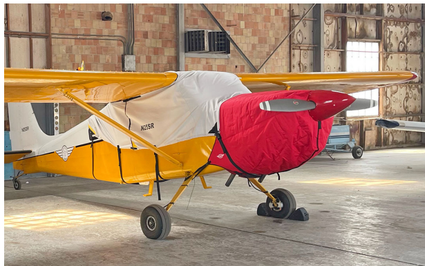
Murphy Super Rebel Insulated Engine Cover