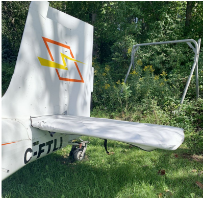
Murphy Elite Horizontal Stabilizer Covers

WINTER USE MATERIAL - Made with Solution-Dyed Polyester fabric, this option is intended for seasonal use to aid in deicing, rain mitigation, or for occasional travel. The material is lighter and more compact, but more susceptible to UV damage and may have a shorter useful life if used continuously outside than the all-year use material.