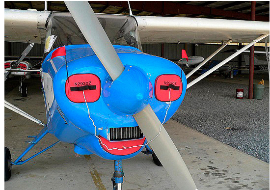
Piper PA-22-150 Engine Inlet Plugs (set of 3)