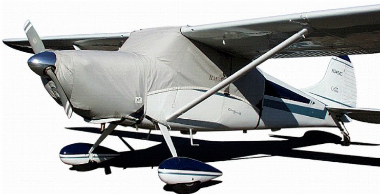
Cessna 170 Canopy Cover & Engine Cover

This cover type is made from Silver Acrylic Sunbrella canvas and is 100% lined with a soft and smooth microfiber. Bruce's Custom Covers developed this material combination especially for aircraft protection. The outer material is medium weight and treated for water resistance, UV resistance and anti-static buildup. The inner lining is a very soft and smooth microfiber to prevent scratching. The material is very reflective, and tests show that the cabin interior temperature can be reduced to near-ambient temperature on the hottest of days. It is water, ice and snow repellent, yet breathable to allow moisture to escape from between the cover and the aircraft surface.