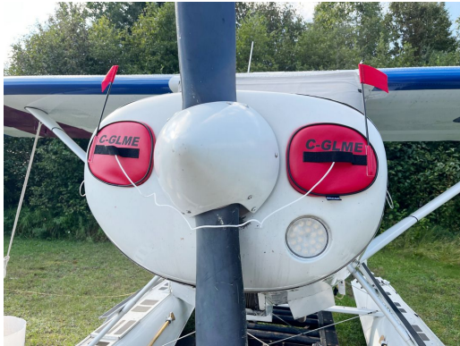
Murphy Rebel Engine Inlet Plugs

Engine Inlet Plugs are custom fit for your Murphy Rebel, Moose, Renegade, Spirit, Elite, etc. intakes, made with heavy-duty vinyl material, and stuffed with a single block of sculpted urethane foam. Each plug has a zipper that allows the foam to be removed and dried if necessary. Engine plugs have warning flags that are visible from the cockpit or 'remove before flight' streamers sewn onto the face of the plugs. Most plugs are imprinted with the aircraft registration number in black for an extra charge. Storage bag NOT included. Engine plugs may be inserted after flight when the engine is still warm. Engine Inlet Plugs are commonly referred to as Cowl Plugs, Intake Plugs, Cowl Blocks, Engine Blocks, and Engine Bungs.