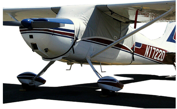
Over-the-Top Canopy Cover