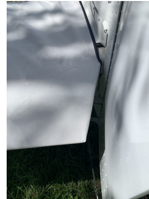
Murphy Elite Horizontal Stabilizer Covers