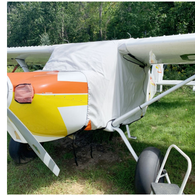
Murphy Elite Over The Top Style Extended Canopy Cover