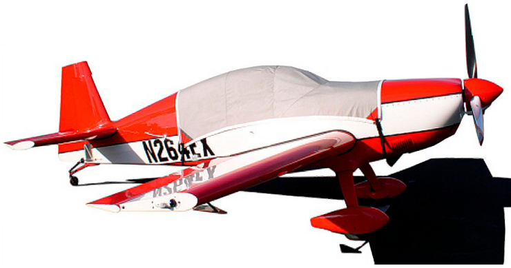
Canopy Cover for the Extra 300