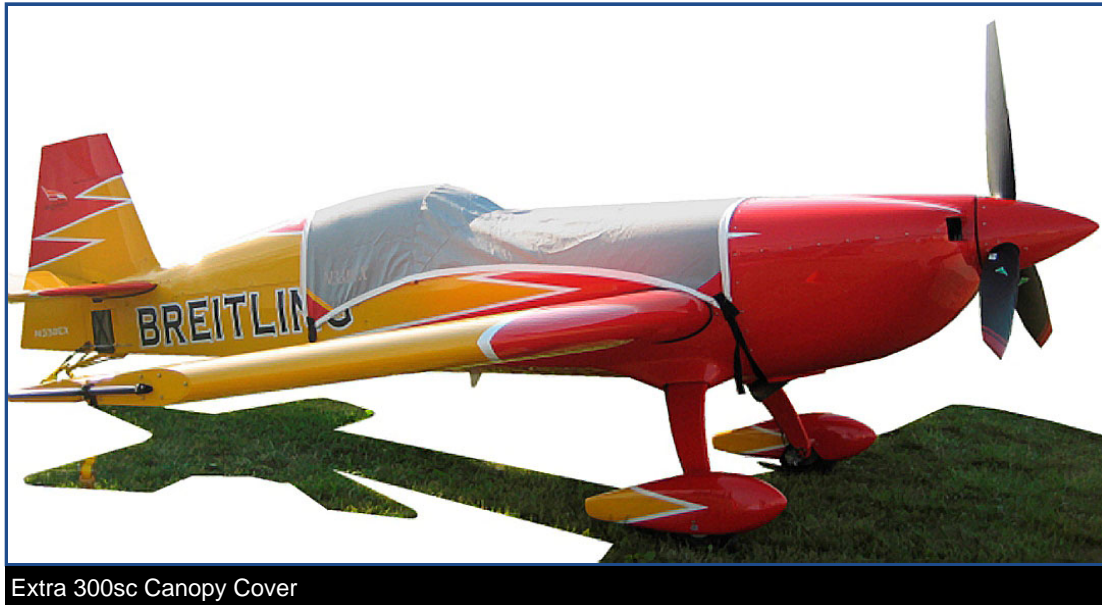
Extra 300sc Canopy Cover