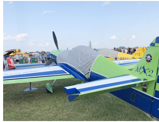
MX2 Lightweight Travel Canopy Cover