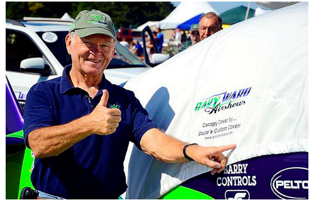
MX-2 Canopy Cover