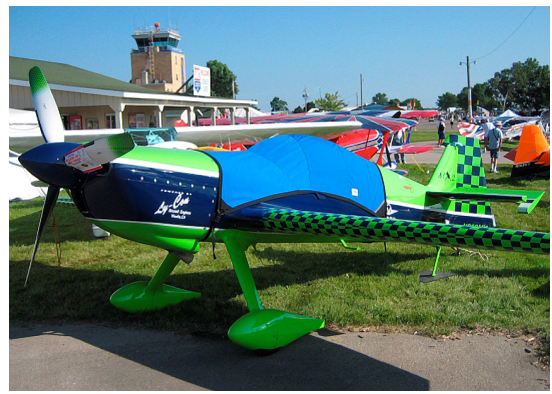
MX-2 Canopy Cover