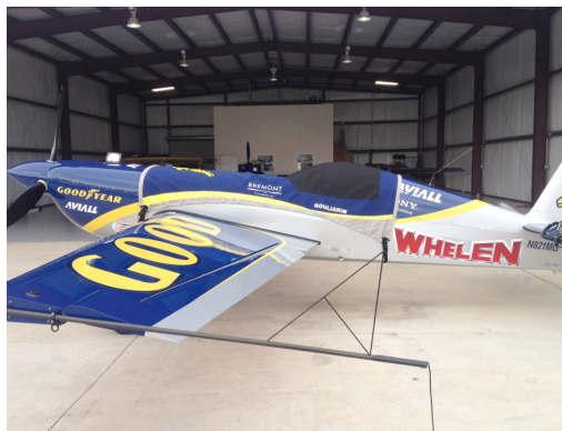
Extra 300SC with NASCAR style custom cover