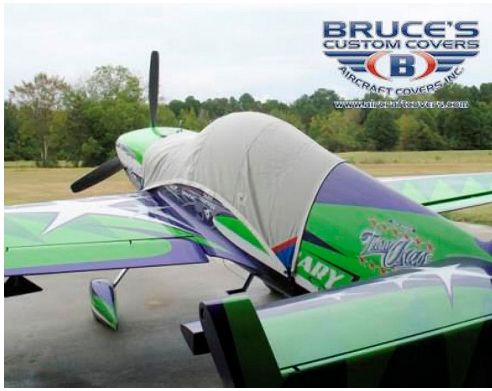
MX-2 Canopy Cover