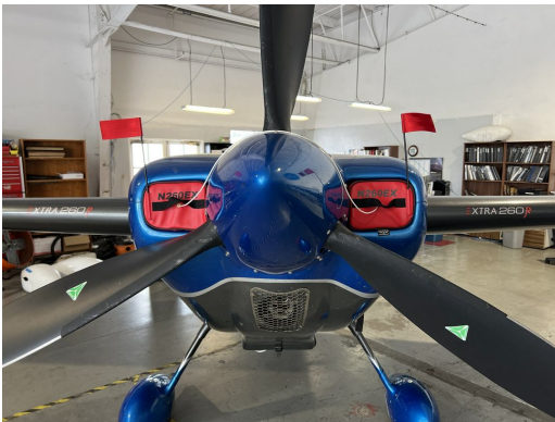
Extra 260 Engine Inlet Plugs

Engine Inlet Plugs are custom fit for your MXR Technologies MXS & MX2 intakes, made with heavy-duty vinyl material, and stuffed with a single block of sculpted urethane foam. Each plug has a zipper that allows the foam to be removed and dried if necessary. Engine plugs have warning flags that are visible from the cockpit or 'remove before flight' streamers sewn onto the face of the plugs. Most plugs are imprinted with the aircraft registration number in black for an extra charge. Storage bag NOT included. Engine plugs may be inserted after flight when the engine is still warm. Engine Inlet Plugs are commonly referred to as Cowl Plugs, Intake Plugs, Cowl Blocks, Engine Blocks, and Engine Bungs.