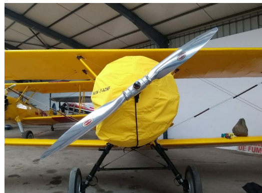
N3N Engine Cover