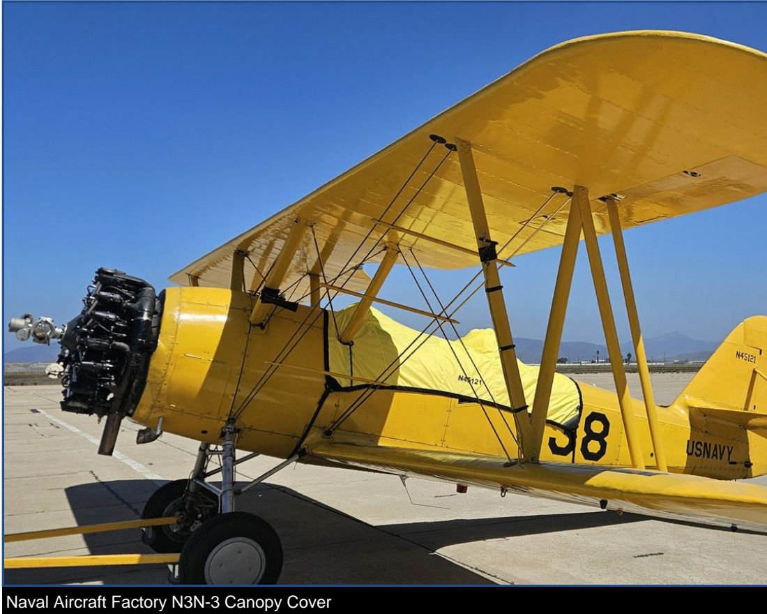
Naval Aircraft Factory N3N-3 Canopy Cover