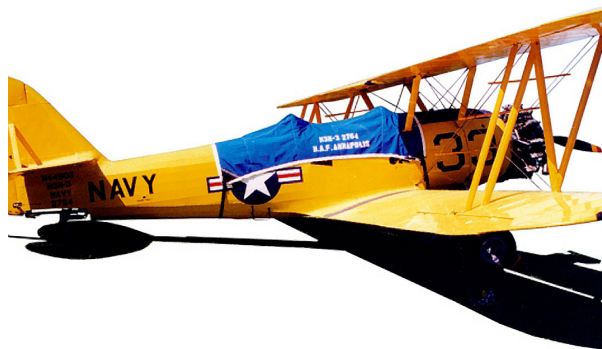
N3N Canopy Cover