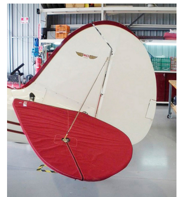
Waco UPF-7 Horizontal Stab. Cover