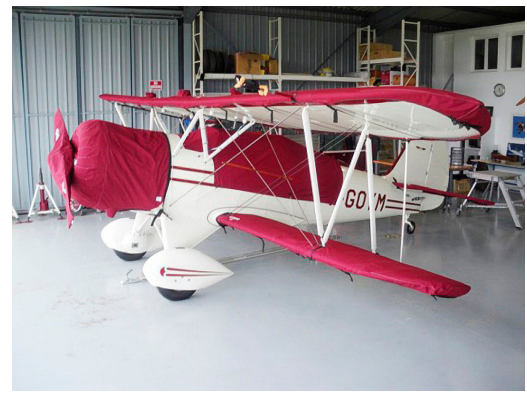
Travel Air 4000 Canopy and Engine Covers, light weight travel type Waco UPF-7 Canopy, Wings, Stab's, Engine, Prop Covers