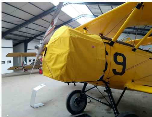
N3N Engine Cover

This cover type is made from Silver Acrylic Sunbrella canvas and is 100% lined with a soft and smooth microfiber. Bruce's Custom Covers developed this material combination especially for aircraft protection. The outer material is medium weight and treated for water resistance, UV resistance and anti-static buildup. The inner lining is a very soft and smooth microfiber to prevent scratching. The material is very reflective, and tests show that the cabin interior temperature can be reduced to near-ambient temperature on the hottest of days. It is water, ice and snow repellent, yet breathable to allow moisture to escape from between the cover and the aircraft surface.