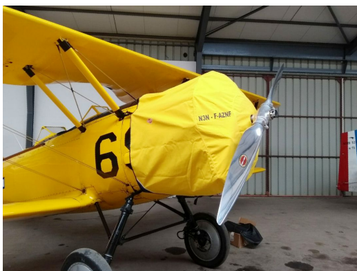
N3N Engine Cover

This cover type is made from Silver Acrylic Sunbrella canvas and is 100% lined with a soft and smooth microfiber. Bruce's Custom Covers developed this material combination especially for aircraft protection. The outer material is medium weight and treated for water resistance, UV resistance and anti-static buildup. The inner lining is a very soft and smooth microfiber to prevent scratching. The material is very reflective, and tests show that the cabin interior temperature can be reduced to near-ambient temperature on the hottest of days. It is water, ice and snow repellent, yet breathable to allow moisture to escape from between the cover and the aircraft surface.