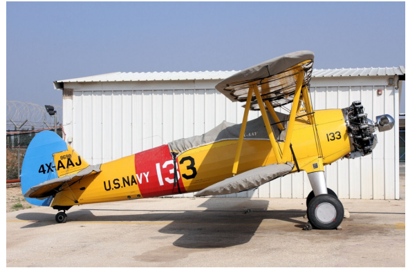
Travel Air 4000 Canopy and Engine Covers, light weight travel type Boeing Stearman PT-13 Canopy, Wing & Horiz. Stab Covers