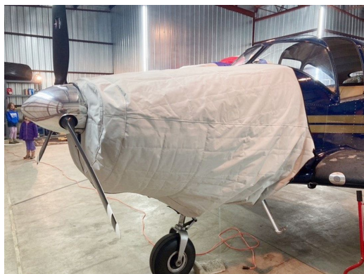
Navion Insulated Engine Cover

This cover type is made from Silver Acrylic Sunbrella canvas and is 100% lined with a soft and smooth microfiber. Bruce's Custom Covers developed this material combination especially for aircraft protection. The outer material is medium weight and treated for water resistance, UV resistance and anti-static buildup. The inner lining is a very soft and smooth microfiber to prevent scratching. The material is very reflective, and tests show that the cabin interior temperature can be reduced to near-ambient temperature on the hottest of days. It is water, ice and snow repellent, yet breathable to allow moisture to escape from between the cover and the aircraft surface.