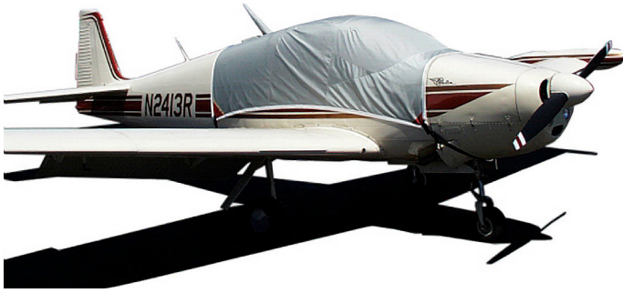
Covers & Plugs for the Navion Rangemaster