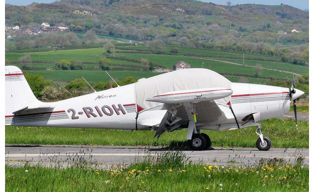
Navion Rangemaster Canopy Cover