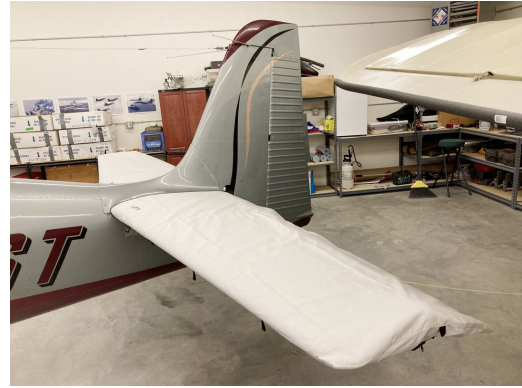
Navion Rangemaster Horizontal Stabilizer Covers