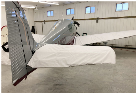
Navion Rangemaster Wing & Horizontal Stabilizer Covers