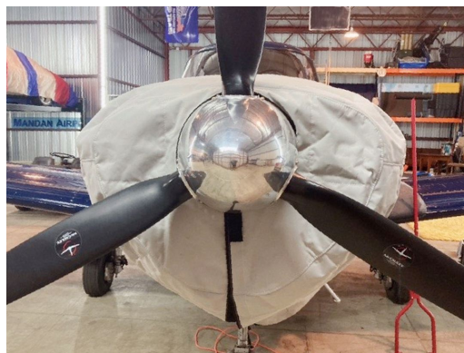
Navion Insulated Engine Cover