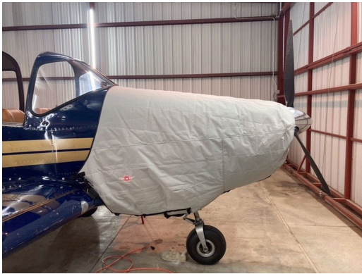
Navion Insulated Engine Cover

This cover type is made from Silver Acrylic Sunbrella canvas and is 100% lined with a soft and smooth microfiber. Bruce's Custom Covers developed this material combination especially for aircraft protection. The outer material is medium weight and treated for water resistance, UV resistance and anti-static buildup. The inner lining is a very soft and smooth microfiber to prevent scratching. The material is very reflective, and tests show that the cabin interior temperature can be reduced to near-ambient temperature on the hottest of days. It is water, ice and snow repellent, yet breathable to allow moisture to escape from between the cover and the aircraft surface.