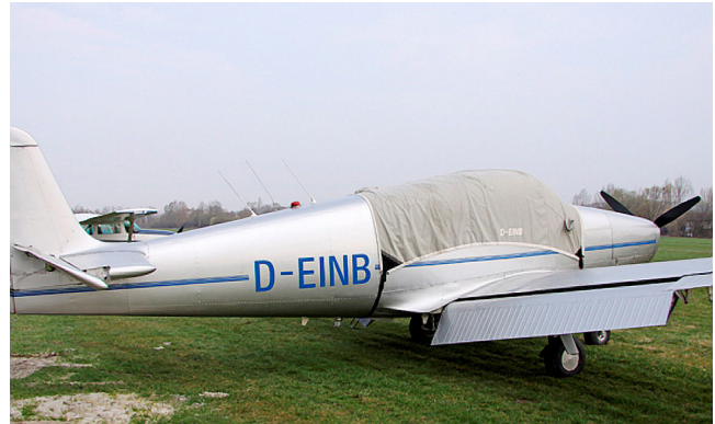
Navion Rangemaster Canopy Cover