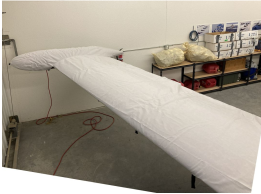
Navion Rangemaster Wing Covers

shorter useful life if used continuously outside than the all-year use material.