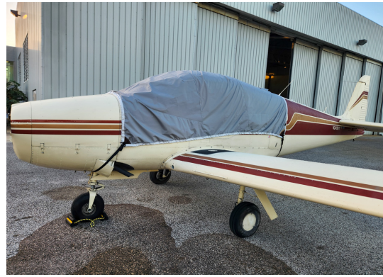
Navion Rangemaster Travel Cover, Light Weight Canopy Cover, (Super Slope windshield)