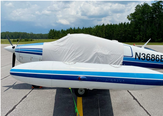
Navion Rangemaster Extended Canopy Cover

This cover type is made from Silver Acrylic Sunbrella canvas and is 100% lined with a soft and smooth microfiber. Bruce's Custom Covers developed this material combination especially for aircraft protection. The outer material is medium weight and treated for water resistance, UV resistance and anti-static buildup. The inner lining is a very soft and smooth microfiber to prevent scratching. The material is very reflective, and tests show that the cabin interior temperature can be reduced to near-ambient temperature on the hottest of days. It is water, ice and snow repellent, yet breathable to allow moisture to escape from between the cover and the aircraft surface.