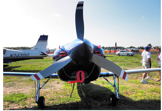
Nemesis NXT Engine Inlet Plug set