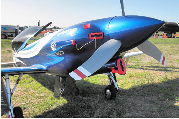
Nemesis NXT Engine Inlet Plug set

Engine Inlet Plugs are custom fit for your Nemesis NXT intakes, made with heavy-duty vinyl material, and stuffed with a single block of sculpted urethane foam. Each plug has a zipper that allows the foam to be removed and dried if necessary. Engine plugs have warning flags that are visible from the cockpit or 'remove before flight' streamers sewn onto the face of the plugs. Most plugs are imprinted with the aircraft registration number in black for an extra charge. Storage bag NOT included. Engine plugs may be inserted after flight when the engine is still warm. Engine Inlet Plugs are commonly referred to as Cowl Plugs, Intake Plugs, Cowl Blocks, Engine Blocks, and Engine Bungs.