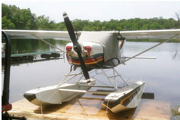
Glastar Sportsman Canopy Cover and Engine Plugs

Engine Inlet Plugs are custom fit for your OMF Symphony 160 intakes, made with heavy-duty vinyl material, and stuffed with a single block of sculpted urethane foam. Each plug has a zipper that allows the foam to be removed and dried if necessary. Engine plugs have warning flags that are visible from the cockpit or 'remove before flight' streamers sewn onto the face of the plugs. Most plugs are imprinted with the aircraft registration number in black for an extra charge. Storage bag NOT included. Engine plugs may be inserted after flight when the engine is still warm. Engine Inlet Plugs are commonly referred to as Cowl Plugs, Intake Plugs, Cowl Blocks, Engine Blocks, and Engine Bungs.