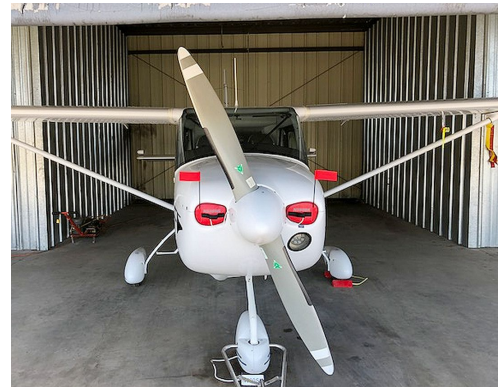
2006 OMF Symphony SA160