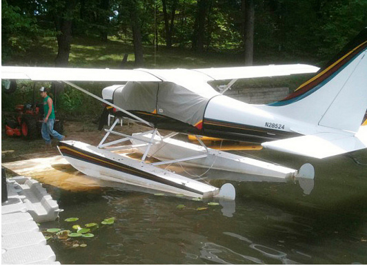
Glstar Sportsman Canopy Cover

This cover type is made from Silver Acrylic Sunbrella canvas and is 100% lined with a soft and smooth microfiber. Bruce's Custom Covers developed this material combination especially for aircraft protection. The outer material is medium weight and treated for water resistance, UV resistance and anti-static buildup. The inner lining is a very soft and smooth microfiber to prevent scratching. The material is very reflective, and tests show that the cabin interior temperature can be reduced to near-ambient temperature on the hottest of days. It is water, ice and snow repellent, yet breathable to allow moisture to escape from between the cover and the aircraft surface.