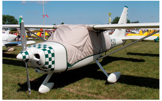
Glstar Over-Top Canopy Cover