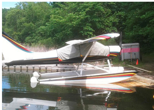
Glastar Sportsman Canopy Cover