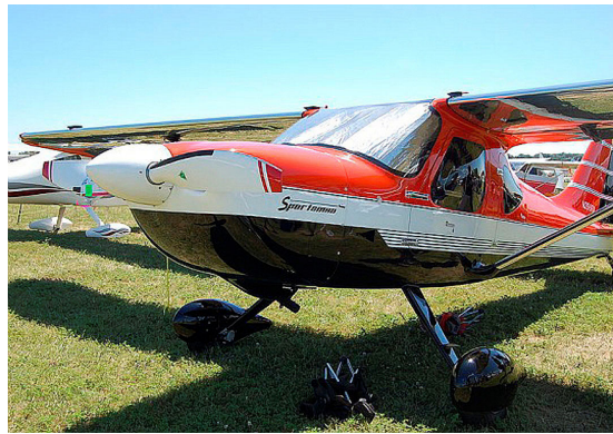
Glstar Sportsman Windshield HeatShield

Windshield Heatshields are interior sunshades for an aircraft's front windshield. The product is a unique composite of closed-cell foam with a silver mylar finish. The semi-rigid design is stiff enough to stand along the inside of the windshield using sun visors or window framing. It folds up flat and easily stores in the included storage sleeve. Some designs may require velcro and suction cups or split right and left sides. A Heatshield is an excellent short-term remedy for cockpit overheating. An external fabric cover is far more effective and practical for long-term protection.