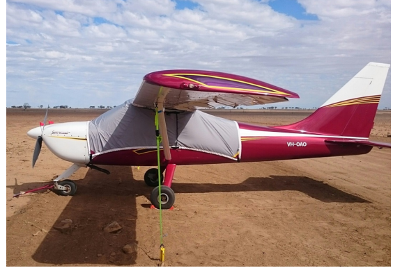
Glstar Sportsman Light Weight Travel Cover