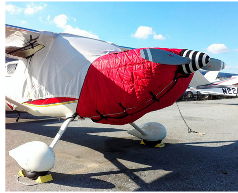
Glstar Insulated Engine Cover