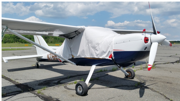
Glastar Over-Top Canopy Cover, Engine Plugs

This cover type is made from Silver Acrylic Sunbrella canvas and is 100% lined with a soft and smooth microfiber. Bruce's Custom Covers developed this material combination especially for aircraft protection. The outer material is medium weight and treated for water resistance, UV resistance and anti-static buildup. The inner lining is a very soft and smooth microfiber to prevent scratching. The material is very reflective, and tests show that the cabin interior temperature can be reduced to near-ambient temperature on the hottest of days. It is water, ice and snow repellent, yet breathable to allow moisture to escape from between the cover and the aircraft surface.