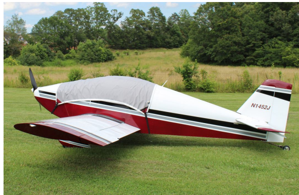
OneX Canopy Cover