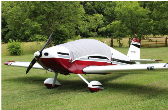
OneX Canopy Cover

Travel Covers are made with Silver Solution-Dyed Polyester fabric and only lined over the windshield to save weight. The material is lightweight and more compact for easy stowage in the aircraft. The polyester material is water resistant, but only intended for occasional use outside. We also have an ultra lightweight material available for fitted hangar dust covers. For daily outdoor use, the non-travel Sunbrella Cover is the best choice.