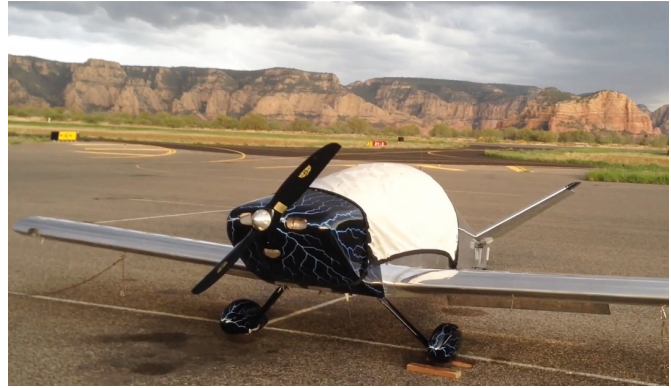
Sonex Canopy Cover