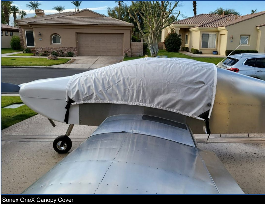
Sonex OneX Canopy Cover