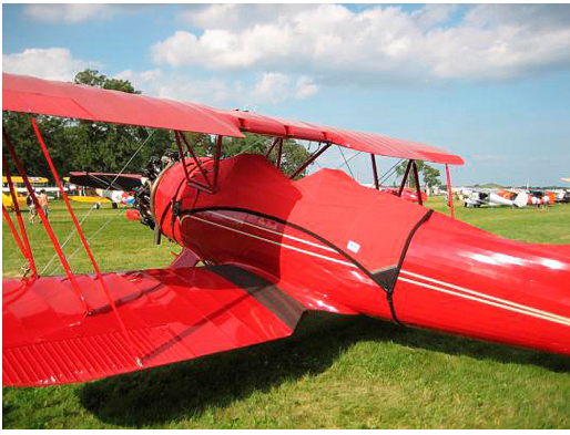
Waco UPF7 Canopy Cover