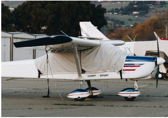
Paradise P-1 Canopy Cover

the hottest of days. It is water, ice and snow repellent, yet breathable to allow moisture to escape from between the cover and the aircraft surface.