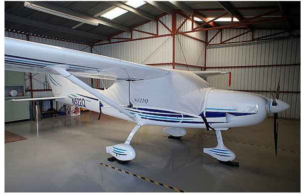
TL Ultralight Sirius Canopy Cover