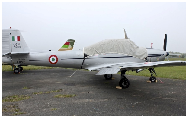
Piaggio P-149 Canopy Cover