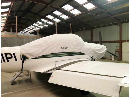
Piaggio FW-149D Canopy/Engine Cover

Cover and Engine Cover. This cover will enclose the engine cowl and will extend aft to cover all of the windows. This cover type is made from Silver Acrylic Sunbrella canvas and is 100% lined with a soft and smooth microfiber. Bruce's Custom Covers developed this material combination especially for aircraft protection. The outer material is medium weight and treated for water resistance, UV resistance and anti-static buildup. The inner lining is a very soft and smooth microfiber to prevent scratching. The material is very reflective, and tests show that the cabin interior temperature can be reduced to near-ambient temperature on the hottest of days. It is water, ice and snow repellent, yet breathable to allow moisture to escape from between the cover and the aircraft surface.