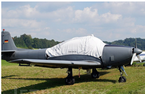
Piaggio P-149 Canopy Cover

Cover and Engine Cover. This cover will enclose the engine cowl and will extend aft to cover all of the windows. This cover type is made from Silver Acrylic Sunbrella canvas and is 100% lined with a soft and smooth microfiber. Bruce's Custom Covers developed this material combination especially for aircraft protection. The outer material is medium weight and treated for water resistance, UV resistance and anti-static buildup. The inner lining is a very soft and smooth microfiber to prevent scratching. The material is very reflective, and tests show that the cabin interior temperature can be reduced to near-ambient temperature on the hottest of days. It is water, ice and snow repellent, yet breathable to allow moisture to escape from between the cover and the aircraft surface.