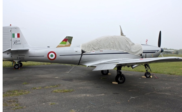
Piaggio P-149 Canopy Cover