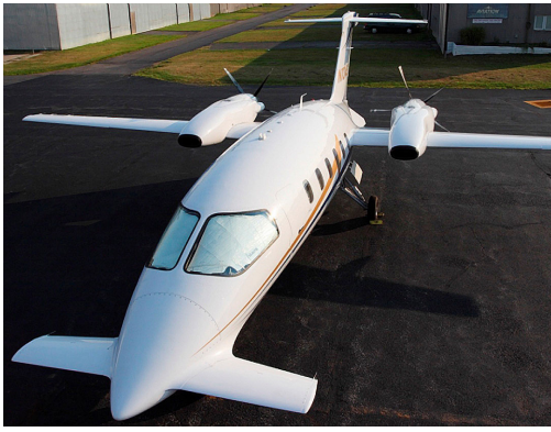
Piaggio 180 Cockpit HeatShields