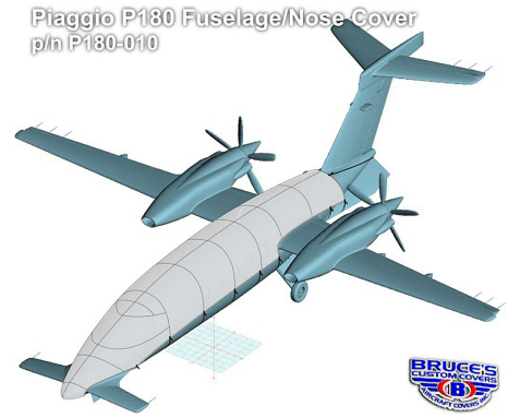
Piaggio 180 Fuselage/Nose Cover