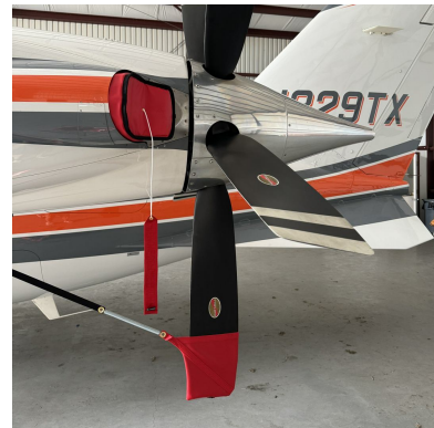
Piaggio P1080 Exhaust Covers & Prop Tie-Downs