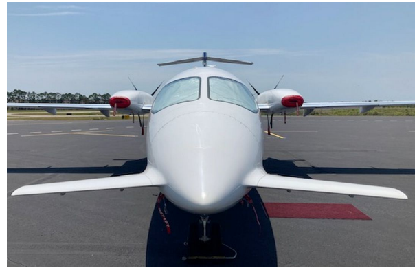
Piaggio P180 Cockpit HeatShields,