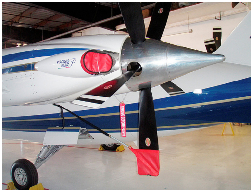
Piaggio 180 Exhaust Covers, Prop Ties

This cover type is made from Silver Acrylic Sunbrella canvas and is 100% lined with a soft and smooth microfiber. Bruce's Custom Covers developed this material combination especially for aircraft protection. The outer material is medium weight and treated for water resistance, UV resistance and anti-static buildup. The inner lining is a very soft and smooth microfiber to prevent scratching. The material is very reflective, and tests show that the cabin interior temperature can be reduced to near-ambient temperature on the hottest of days. It is water, ice and snow repellent, yet breathable to allow moisture to escape from between the cover and the aircraft surface.