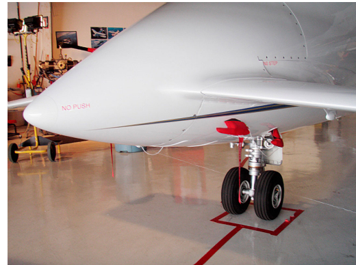
Piaggio 180 Pitot & Rosemount Covers