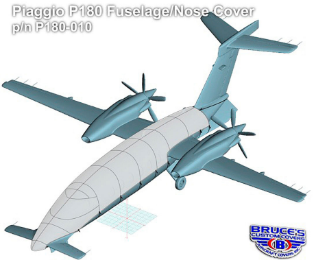
Piaggio 180 Fuselage/Nose Cover