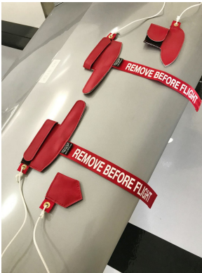
Piaggio P180 Pitot Tube Covers

Engine Inlet Plugs are custom fit for your Piaggio Avanti P180 intakes, made with heavy-duty vinyl material, and stuffed with a single block of sculpted urethane foam. Each plug has a zipper that allows the foam to be removed and dried if necessary. Engine plugs have warning flags that are visible from the cockpit or 'remove before flight' streamers sewn onto the face of the plugs. Most plugs are imprinted with the aircraft registration number in black for an extra charge. Storage bag NOT included. Engine plugs may be inserted after flight when the engine is still warm. Engine Inlet Plugs are commonly referred to as Cowl Plugs, Intake Plugs, Cowl Blocks, Engine Blocks, and Engine Bung.