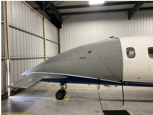
Piaggio 180 Cockpit/Nose Cover, Travel Weight

Travel Covers are made with Silver Solution-Dyed Polyester fabric and only lined over the windshield to save weight. The material is lightweight and more compact for easy stowage in the aircraft. The polyester material is water resistant, but only intended for occasional use outside. We also have an ultra lightweight material available for fitted hangar dust covers. For daily outdoor use, the non-travel Sunbrella Cover is the best choice.