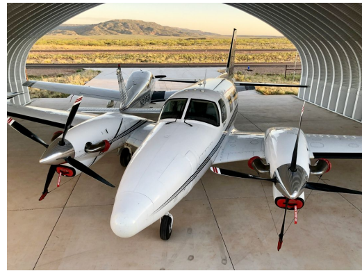
Piper PA-31T Cheyenne Intake Plugs, Prop Tie/Exhaust Covers