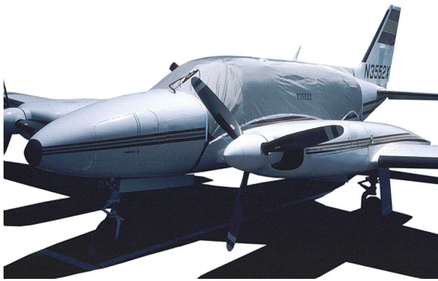
Piper Navajo Canopy Cover

This cover type is made from Silver Acrylic Sunbrella canvas and is 100% lined with a soft and smooth microfiber. Bruce's Custom Covers developed this material combination especially for aircraft protection. The outer material is medium weight and treated for water resistance, UV resistance and anti-static buildup. The inner lining is a very soft and smooth microfiber to prevent scratching. The material is very reflective, and tests show that the cabin interior temperature can be reduced to near-ambient temperature on the hottest of days. It is water, ice and snow repellent, yet breathable to allow moisture to escape from between the cover and the aircraft surface.