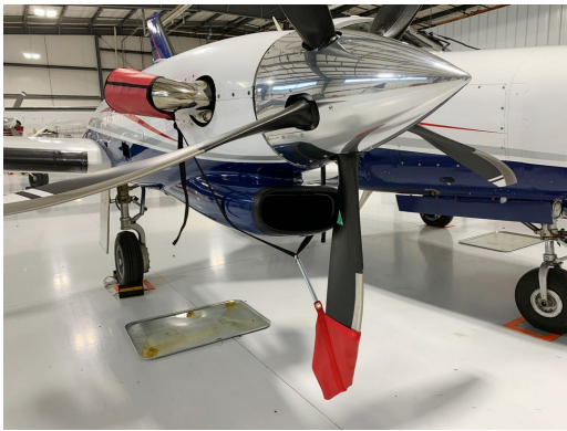
Piper PA-31T Cheyenne II Prop Tie-Downs/Exhaust Covers

This cover type is made from Silver Acrylic Sunbrella canvas and is 100% lined with a soft and smooth microfiber. Bruce's Custom Covers developed this material combination especially for aircraft protection. The outer material is medium weight and treated for water resistance, UV resistance and anti-static buildup. The inner lining is a very soft and smooth microfiber to prevent scratching. The material is very reflective, and tests show that the cabin interior temperature can be reduced to near-ambient temperature on the hottest of days. It is water, ice and snow repellent, yet breathable to allow moisture to escape from between the cover and the aircraft surface.