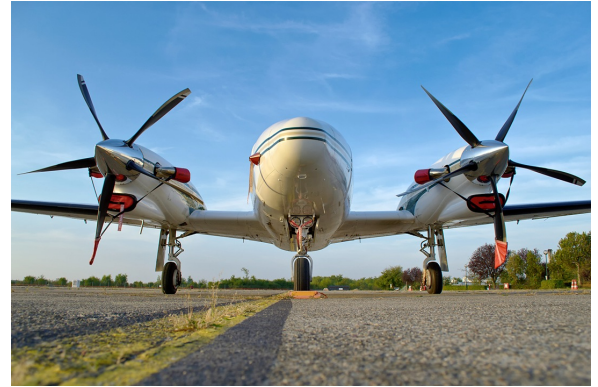
Piper Cheyenne Cockpit Cover, Engine Plugs, Prop Tie/Exhaust Covers Piper Cheyenne Intake Plugs, Exhaust Covers, Prop Ties