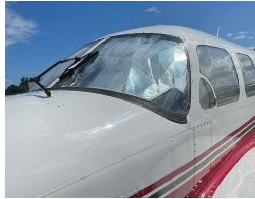
Piper PA-31 Models Cockpit HeatShields