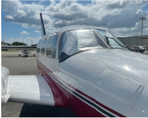
Piper PA-31 Models Cockpit HeatShields

for cockpit overheating, but an external fabric cover is more effective for long-term protection.