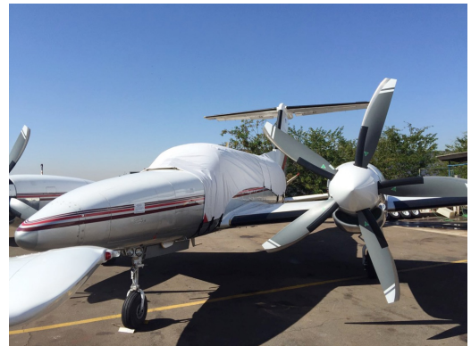
Piper PA-42 Cheyenne IV Canopy Cover