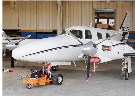
Piper Cheyenne IIXL Prop Tie/Exhaust Covers, Intake Plugs