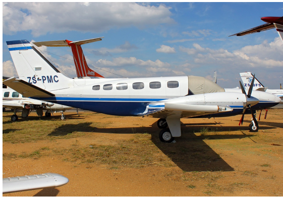
Cessna 441 Conquest II Cockpit Cover

This cover type is made from Silver Acrylic Sunbrella canvas and is 100% lined with a soft and smooth microfiber. Bruce's Custom Covers developed this material combination especially for aircraft protection. The outer material is medium weight and treated for water resistance, UV resistance and anti-static buildup. The inner lining is a very soft and smooth microfiber to prevent scratching. The material is very reflective, and tests show that the cabin interior temperature can be reduced to near-ambient temperature on the hottest of days. It is water, ice and snow repellent, yet breathable to allow moisture to escape from between the cover and the aircraft surface.