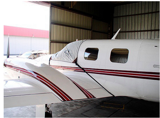
Piper Cheyenne Cockpit Cover