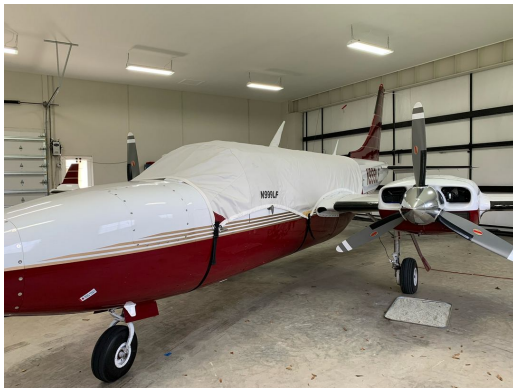
Piper Aerostar PA-60-700P Canopy Cover Windows Only

The Piper PA-601 Aerostar Nose Cover is designed to cover the section of the fuselage forward of the windshield to the tip of the nose. It is secured with belly straps. This cover type is made from Silver Acrylic Sunbrella canvas and is 100% lined with a soft and smooth microfiber. Bruce's Custom Covers developed this material combination especially for aircraft protection. The outer material is medium weight and treated for water resistance, UV resistance and anti-static buildup. The inner lining is a very soft and smooth microfiber to prevent scratching. The material is very reflective, and tests show that the cabin interior temperature can be reduced to near-ambient temperature on the hottest of days. It is water, ice and snow repellent, yet breathable to allow moisture to escape from between the cover and the aircraft surface.