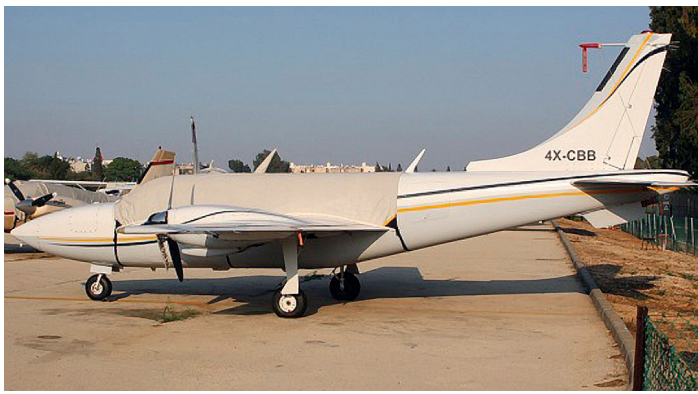
Piper Aerostar Canopy Cover