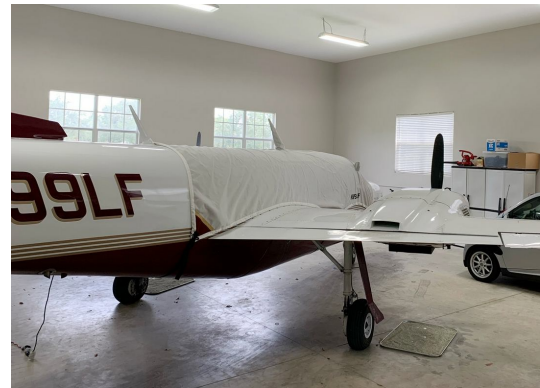
Piper Aerostar PA-60-700P Canopy Cover Windows Only