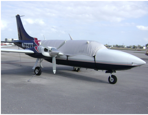
Aerostar Canopy Cover