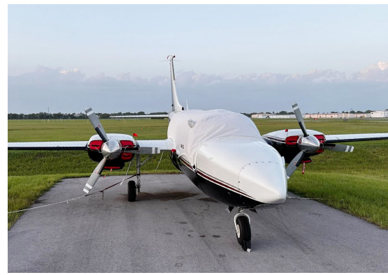
Piper PA-601 Aerostar Canopy Cover (Windows Only), Engine Plugs