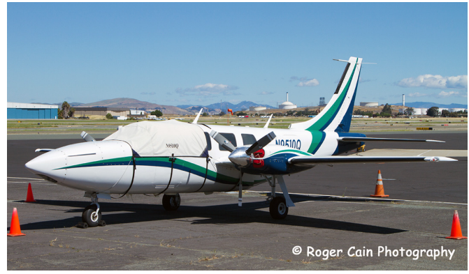
Piper Aerostar Cockpit Cover and Engine Inlet Plugs