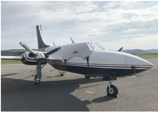
Smith Aerostar 600 Canopy Cover