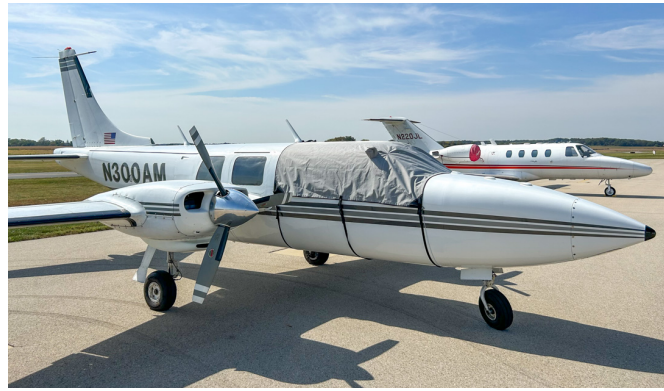
AEROSTAR 601P Travel Cover, Light Weight Travel Cockpit/Skylights Cover