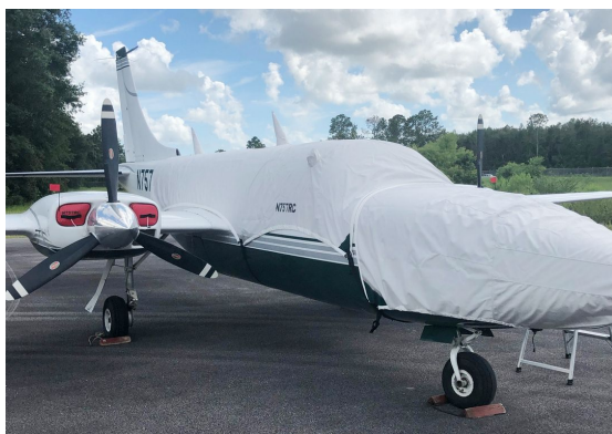
Piper Aerostar Canopy & Nose Covers, Engine Plugs