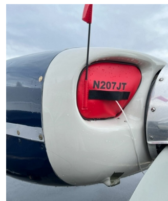
Piper Aerostar Engine Plugs