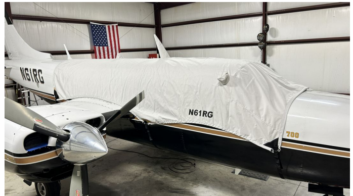
Piper Aerostar 602P Canopy Cover (Windows Only)