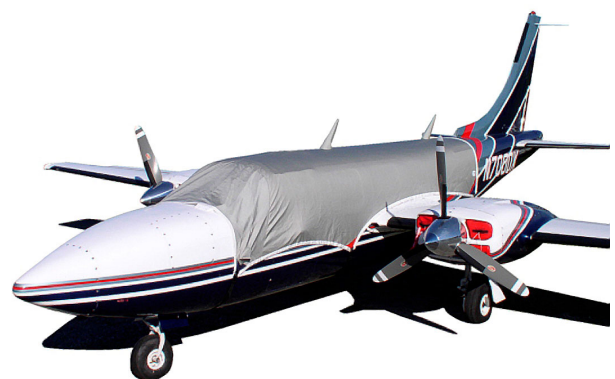
Aerostar Canopy Cover & Plugs