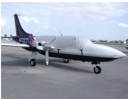
Aerostar Canopy Cover

Travel Covers are made with Silver Solution-Dyed Polyester fabric and only lined over the windshield to save weight. The material is lightweight and more compact for easy stowage in the aircraft. The polyester material is water resistant, but only intended for occasional use outside. We also have an ultra lightweight material available for fitted hangar dust covers. For daily outdoor use, the non-travel Sunbrella Cover is the best choice.