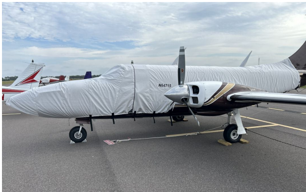
Piper PA-601 Aerostar Fuselage Cover (back to Horiz Stab)

The Piper PA-601 Aerostar Nose Cover is designed to cover the section of the fuselage forward of the windshield to the tip of the nose. It is secured with belly straps. This cover type is made from Silver Acrylic Sunbrella canvas and is 100% lined with a soft and smooth microfiber. Bruce's Custom Covers developed this material combination especially for aircraft protection. The outer material is medium weight and treated for water resistance, UV resistance and anti-static buildup. The inner lining is a very soft and smooth microfiber to prevent scratching. The material is very reflective, and tests show that the cabin interior temperature can be reduced to near-ambient temperature on the hottest of days. It is water, ice and snow repellent, yet breathable to allow moisture to escape from between the cover and the aircraft surface.