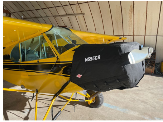
Piper PA-11 Replica Insulated Engine Cover