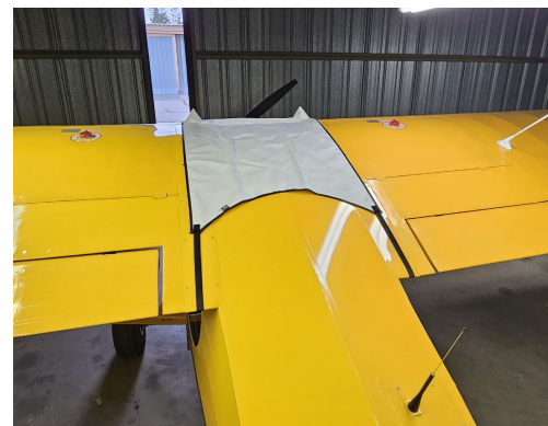
Piper PA-11 Over-Top Canopy Cover, extends to cover gas caps Piper PA-12: Super Cruiser, J5 Cub Windshield/Skylight Cover