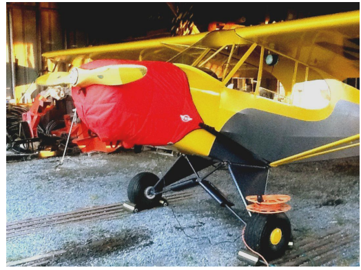
Piper PA-11 Cub Special Insulated Engine Cover