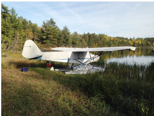
Piper PA-11 Cover Set

This cover type is made from Silver Acrylic Sunbrella canvas and is 100% lined with a soft and smooth microfiber. Bruce's Custom Covers developed this material combination especially for aircraft protection. The outer material is medium weight and treated for water resistance, UV resistance and anti-static buildup. The inner lining is a very soft and smooth microfiber to prevent scratching. The material is very reflective, and tests show that the cabin interior temperature can be reduced to near-ambient temperature on the hottest of days. It is water, ice and snow repellent, yet breathable to allow moisture to escape from between the cover and the aircraft surface.