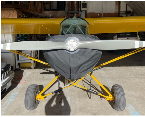
Piper PA-11 Replica Insulated Engine Cover