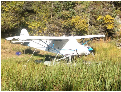
Piper PA-11 Cover Set