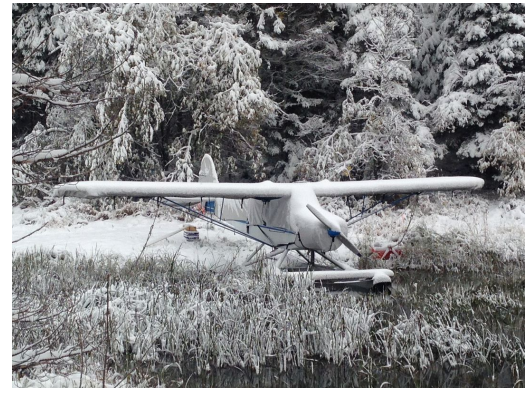
Piper PA-11 Cover Set