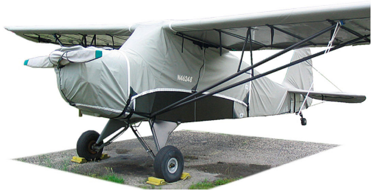
Piper PA-12 Abbreviated Empennage Cover Prop Cover, Engine Cover, Canopy Cover, Wing Covers and Empennage Cover