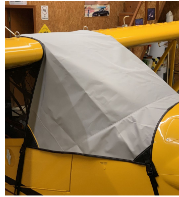
Cub Crafters Carbon Cub FX3 Windshield/Skylight Cover, travel weight