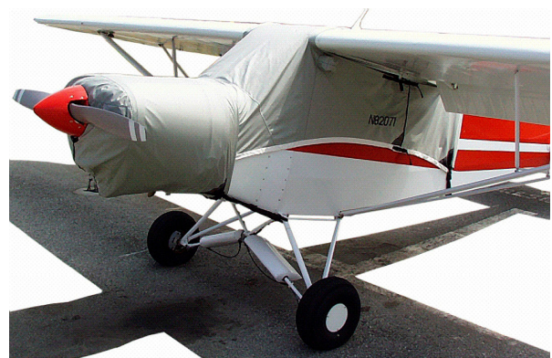
Piper PA-18 Canopy & Engine Covers