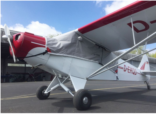
Piper Super Cub Travel Weight Canopy Cover

the hottest of days. It is water, ice and snow repellent, yet breathable to allow moisture to escape from between the cover and the aircraft surface.