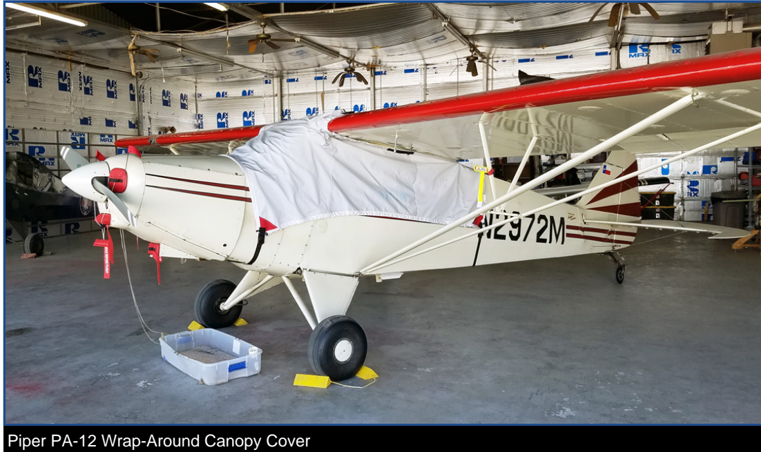
Piper PA-12 Wrap-Around Canopy Cover