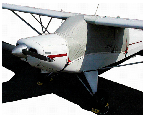
Piper PA-12 Super Cruiser Over-Top Canopy Cover

This cover type is made from Silver Acrylic Sunbrella canvas and is 100% lined with a soft and smooth microfiber. Bruce's Custom Covers developed this material combination especially for aircraft protection. The outer material is medium weight and treated for water resistance, UV resistance and anti-static buildup. The inner lining is a very soft and smooth microfiber to prevent scratching. The material is very reflective, and tests show that the cabin interior temperature can be reduced to near-ambient temperature on the hottest of days. It is water, ice and snow repellent, yet breathable to allow moisture to escape from between the cover and the aircraft surface.