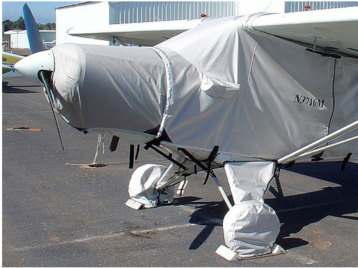
Piper PA-12 Landing Gear Covers

ALL-YEAR USE MATERIAL - Made with Silver Acrylic Sunbrella canvas, the all-year use material is the best option for sun protection and cover longevity. This heavier more durable material is intended for all weather conditions, such as rain and snow or lots of sun.