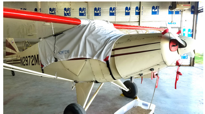
Piper PA-12 Wrap-Around Canopy Cover, Engine Plugs