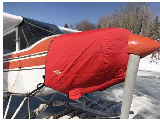
Piper PA-12 Insulated Engine Cover