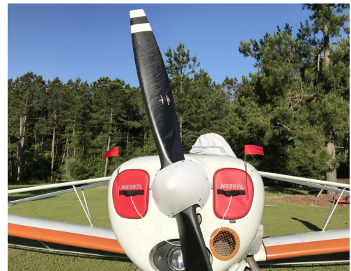
Piper Pawnee PA-25 Engine Inlet Plugs