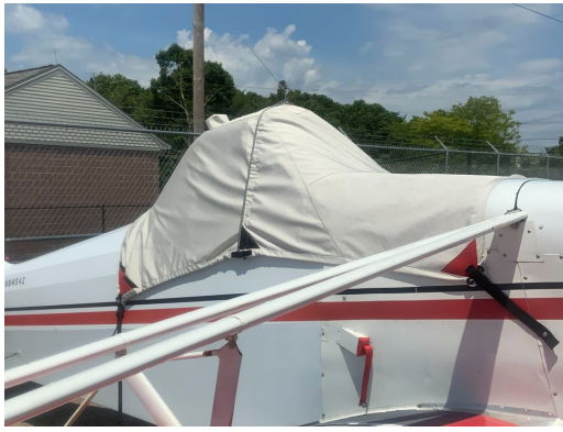
Piper PA-25 Pawnee Canopy/Hopper Cover