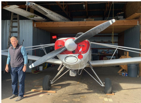
Piper PA-25 Pawnee Engine Plugs

Engine Inlet Plugs are custom fit for your Piper Pawnee PA-25 intakes, made with heavy-duty vinyl material, and stuffed with a single block of sculpted urethane foam. Each plug has a zipper that allows the foam to be removed and dried if necessary. Engine plugs have warning flags that are visible from the cockpit or 'remove before flight' streamers sewn onto the face of the plugs. Most plugs are imprinted with the aircraft registration number in black for an extra charge. Storage bag NOT included. Engine plugs may be inserted after flight when the engine is still warm. Engine Inlet Plugs are commonly referred to as Cowl Plugs, Intake Plugs, Cowl Blocks, Engine Blocks, and Engine Bungs.