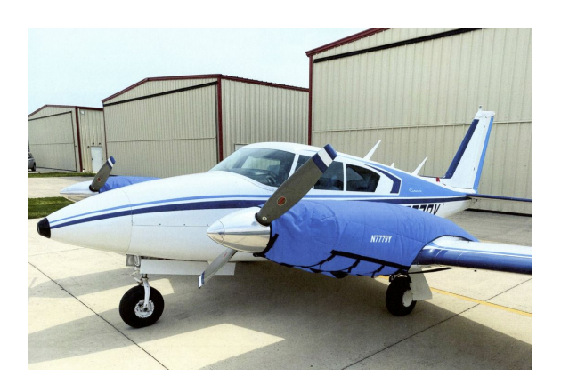
Piper PA-30 Twin Comanche Insulated Engine Covers