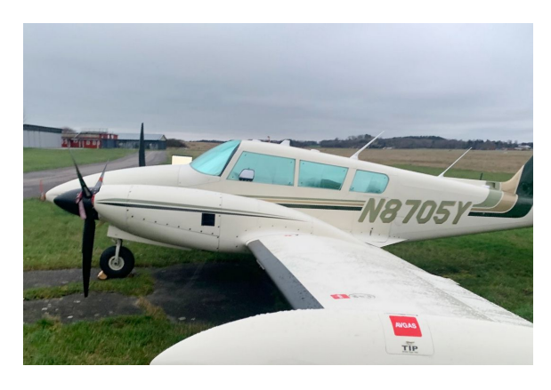
Piper PA-30 Twin Comanche HeatShields