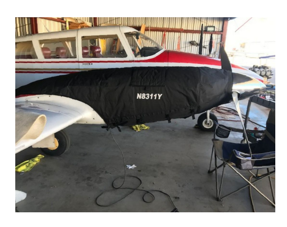
Piper PA-30 Twin Comanche Insulated Engine Cover