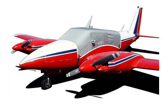
Piper Twin Comanche Canopy Cover