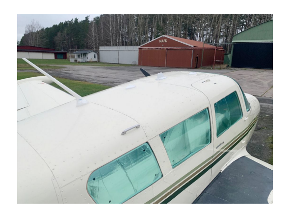
Piper PA-30 Twin Comanche HeatShields