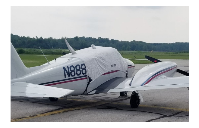
Piper PA-30 Twin Comanche Canopy Cover