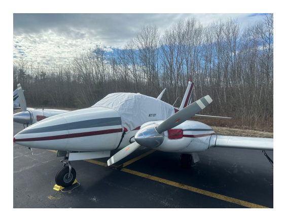
Piper PA-30 Twin Comanche Canopy Cover