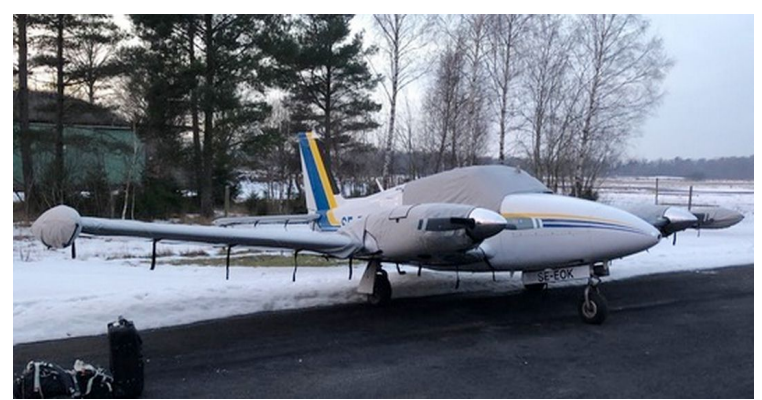
Piper Twin Comanche Wing & Insulated Engine Covers