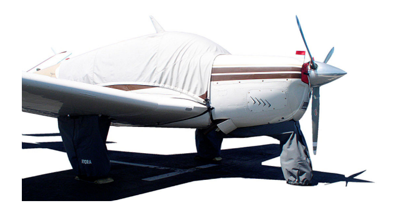
Beech Bonanza/Debonair/Baron Landing Gear Covers