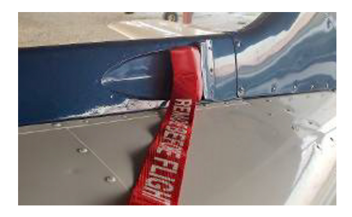
Piper PA-30/39 Twin Comanche Engine Inlet Plugs (Lo Presti "Wow" Cowl)