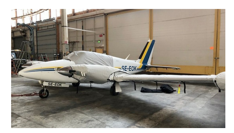
Piper Twin Comanche Wing & Insulated Engine Covers

WINTER USE MATERIAL - Made with Solution-Dyed Polyester fabric, this option is intended for seasonal use to aid in deicing, rain mitigation, or for occasional travel. The material is lighter and more compact, but more susceptible to UV damage and may have a shorter useful life if used continuously outside than the all-year use material.