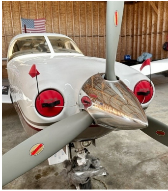
Piper PA-32 Saratoga Engine Inlet Plugs

Engine plugs may be inserted after flight when the engine is still warm. Engine Inlet Plugs are commonly referred to as Cowl Plugs, Intake Plugs, Cowl Blocks, Engine Blocks, and Engine Bungs.