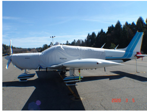
Piper PA-32-300 Extended Canopy, Engine, Prop & Tailcone Covers