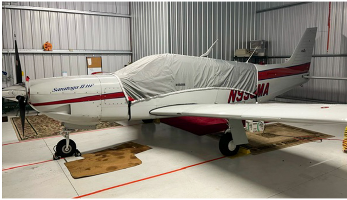
Piper PA-32 Saratoga, Cherokee 6, Lance Travel Cover, Light Weight Canopy Cover