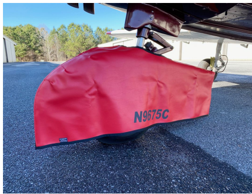
Piper PA-32 Saratoga Front Wheelpant Cover