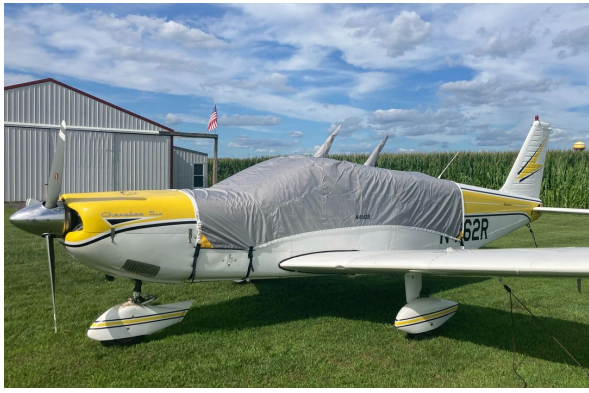
Piper PA-32-301T Travel Weight Canopy Cover, w/fwd bib.