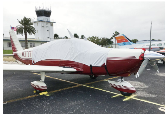
Piper PA-32-300 Canopy Cover w/baggage area extension Piper PA-32-260 Canopy Cover W/Fwd Bib To Cover Baggage Door