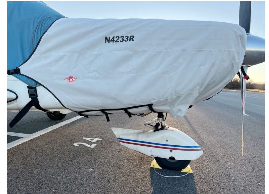
Piper PA-32-300 Fully Enclosed Engine Cover