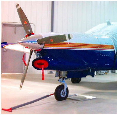
Piper Turbo Saratoga or Lance Engine Inlet Plug