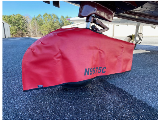
Piper PA-32 Saratoga Front Wheelpant Cover

ALL-YEAR USE MATERIAL - Made with Silver Acrylic Sunbrella canvas, the all-year use material is the best option for sun protection and cover longevity. This heavier more durable material is intended for all weather conditions, such as rain and snow or lots of sun.