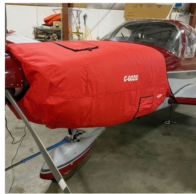
Piper PA-32 Saratoga, Cherokee 6, Lance Insulated Engine Cover