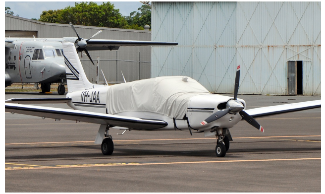
Piper PA-32-300 Canopy Cover w/baggage area extension