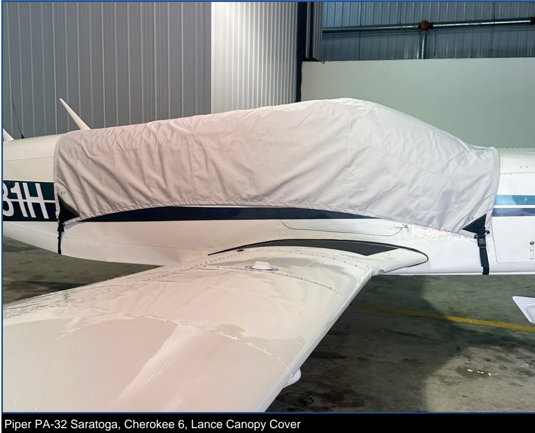
Piper PA-32 Saratoga, Cherokee 6, Lance Canopy Cover