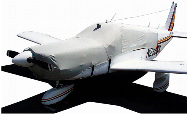
Piper Cherokee Six Canopy/Engine Cover