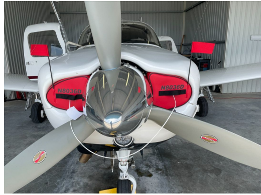
Piper PA-32R-301 Engine Inlet Plugs