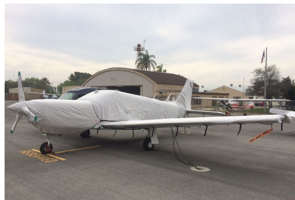
Piper Saratoga Cover Set