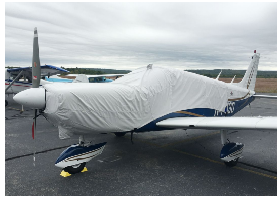
Piper PA-32 Cherokee Six Canopy/Nose Cover