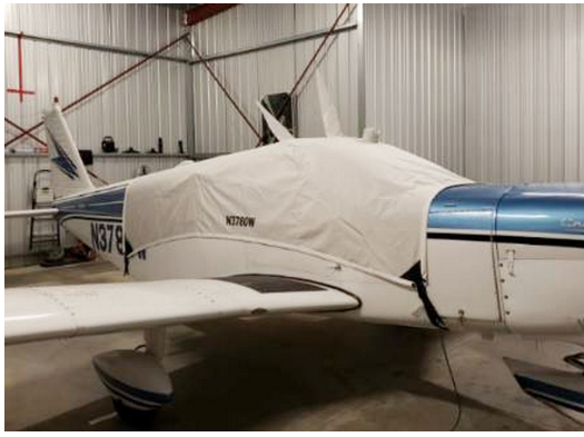
Piper PA-32-260 Canopy Cover