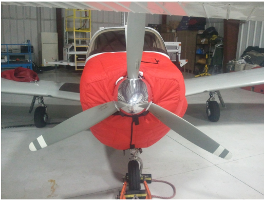
Piper PA-32 Insulated Engine Cover