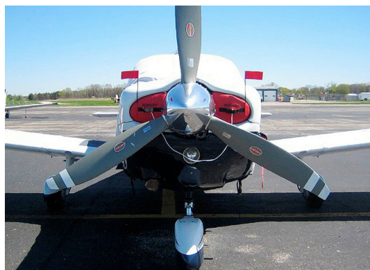
Piper PA-32 Cherokee 6 Engine Inlet Plugs