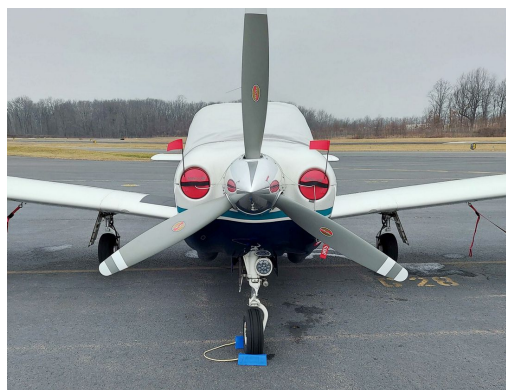
Piper PA-32R-301 Engine Plugs