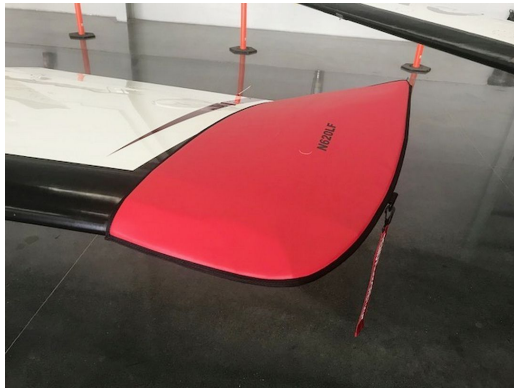
Piper Meridian Wingtip Pads, M600 Models

Designed to prevent damage to the aircraft extremities in crowded hangars, these products are made of bright red Naugahyde and thickly padded with a sandwich of closed cell foam.