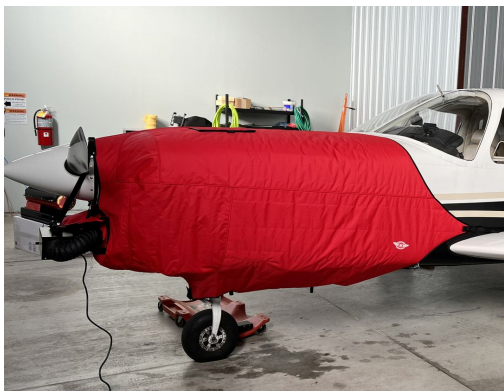
Piper PA-32RT-300T Insulated Engine Cover