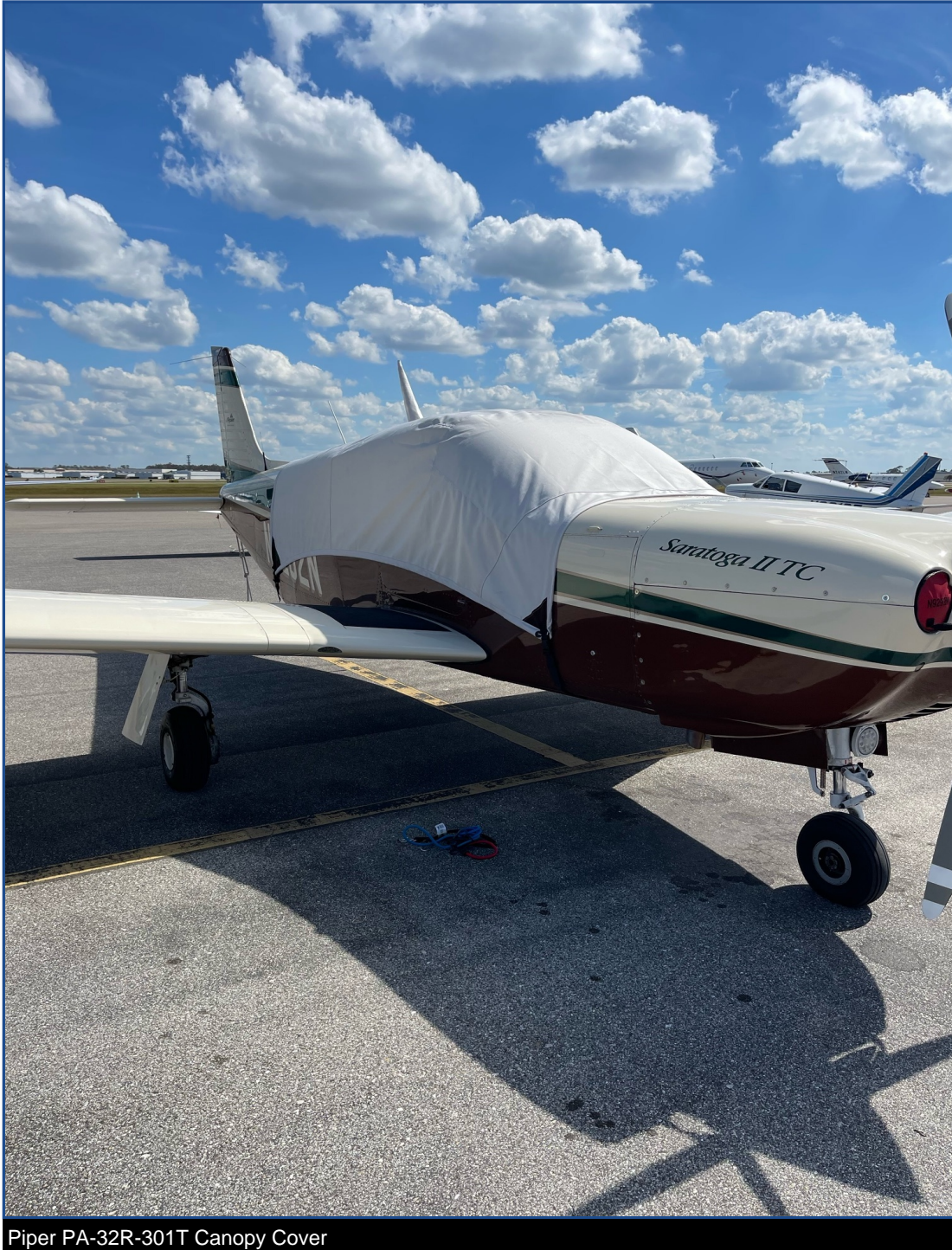
Piper PA-32R-301T Canopy Cover