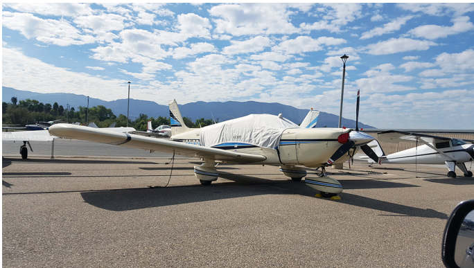
Piper Saratoga Canopy Cover for Piper Pa-32-300

This cover type is made from Silver Acrylic Sunbrella canvas and is 100% lined with a soft and smooth microfiber. Bruce's Custom Covers developed this material combination especially for aircraft protection. The outer material is medium weight and treated for water resistance, UV resistance and anti-static buildup. The inner lining is a very soft and smooth microfiber to prevent scratching. The material is very reflective, and tests show that the cabin interior temperature can be reduced to near-ambient temperature on the hottest of days. It is water, ice and snow repellent, yet breathable to allow moisture to escape from between the cover and the aircraft surface.