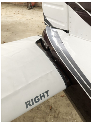
Piper PA-28 Horizontal Stabilizer Cover

WINTER USE MATERIAL - Made with Solution-Dyed Polyester fabric, this option is intended for seasonal use to aid in deicing, rain mitigation, or for occasional travel. The material is lighter and more compact, but more susceptible to UV damage and may have a shorter useful life if used continuously outside than the all-year use material.