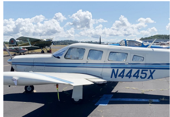
Piper PA32-300 HeatShield Set