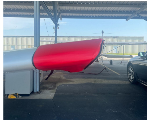
Piper PA-28-140 Wingtip Pads