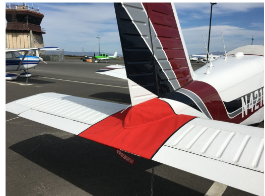
Piper PA-32 Models Tailcone Cover, Fully Enclosed