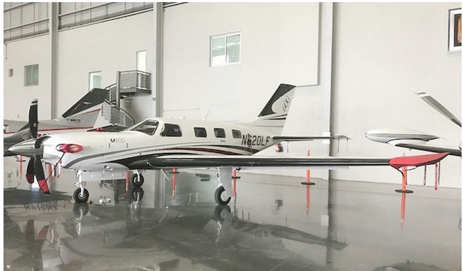
Piper Meridian Wingtip Pads, M600 Models