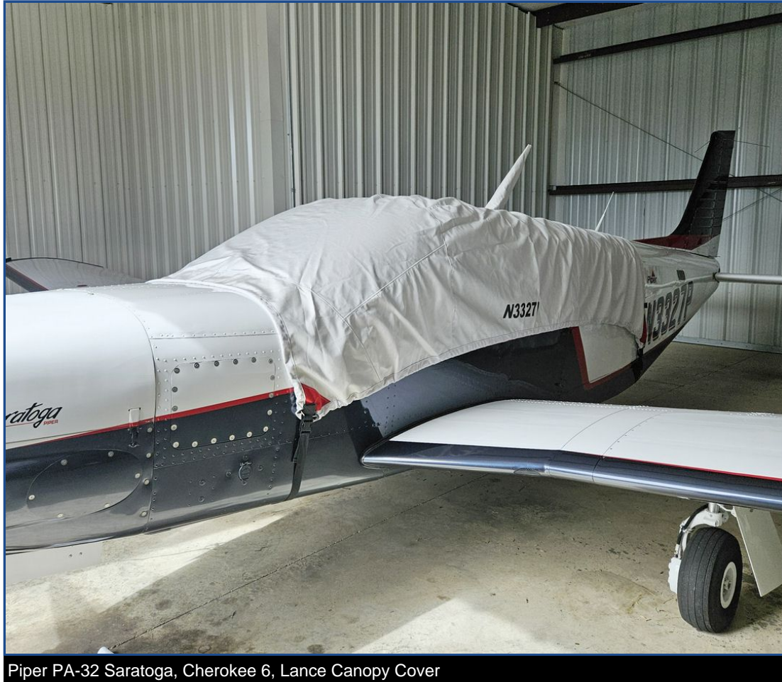
Piper PA-32 Saratoga, Cherokee 6, Lance Canopy Cover