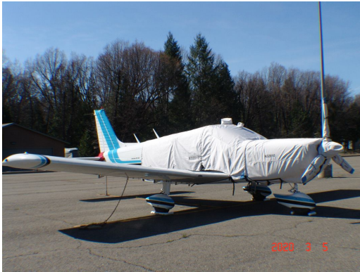
Piper PA-32-300 Extended Canopy, Engine, Prop & Tailcone Covers

This cover type is made from Silver Acrylic Sunbrella canvas and is 100% lined with a soft and smooth microfiber. Bruce's Custom Covers developed this material combination especially for aircraft protection. The outer material is medium weight and treated for water resistance, UV resistance and anti-static buildup. The inner lining is a very soft and smooth microfiber to prevent scratching. The material is very reflective, and tests show that the cabin interior temperature can be reduced to near-ambient temperature on the hottest of days. It is water, ice and snow repellent, yet breathable to allow moisture to escape from between the cover and the aircraft surface.