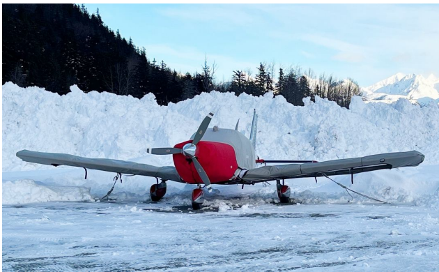
Piper PA-32-260 Winter Cover Set

WINTER USE MATERIAL - Made with Solution-Dyed Polyester fabric, this option is intended for seasonal use to aid in deicing, rain mitigation, or for occasional travel. The material is lighter and more compact, but more susceptible to UV damage and may have a shorter useful life if used continuously outside than the all-year use material.