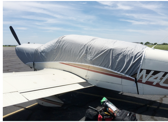
Piper PA-32 Saratoga, Cherokee 6, Lance Travel Cover, Light Weight Travel Canopy/Engine Cover