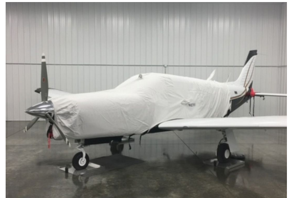
Piper PA-32 Extended Canopy/Engine Cover