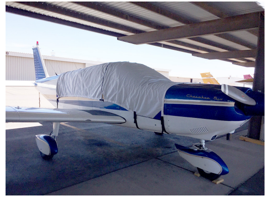
Piper PA-32 Canopy Cover with forward bib