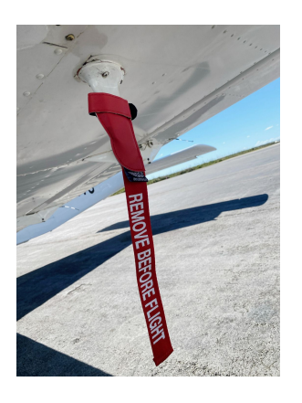
Piper PA-34-200T Pitot Cover (Original Straight Blade Type)