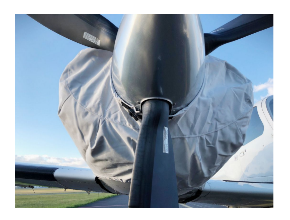
Piper PA-34 Seneca II Fully Enclosed Engine Covers