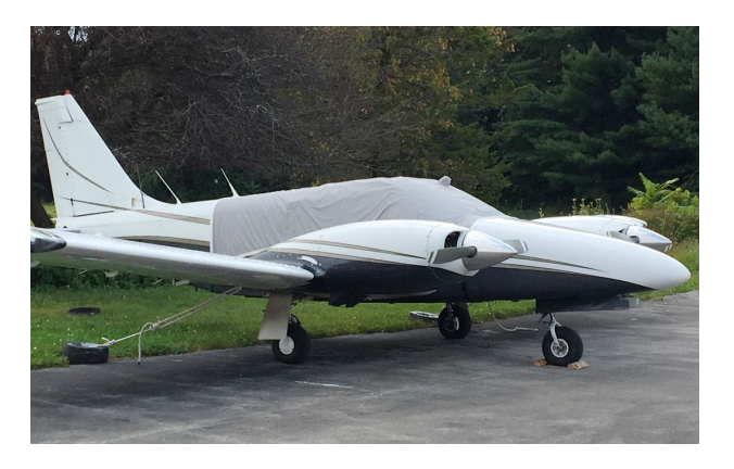
Piper Seneca Light Weight Travel Canopy Cover