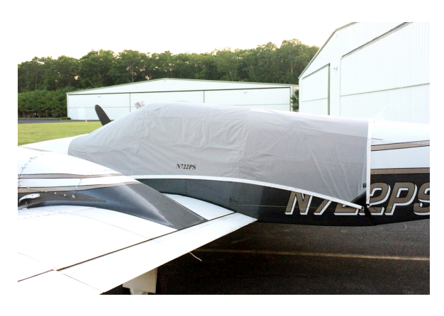
Piper PA-34 Seneca Travel Cover