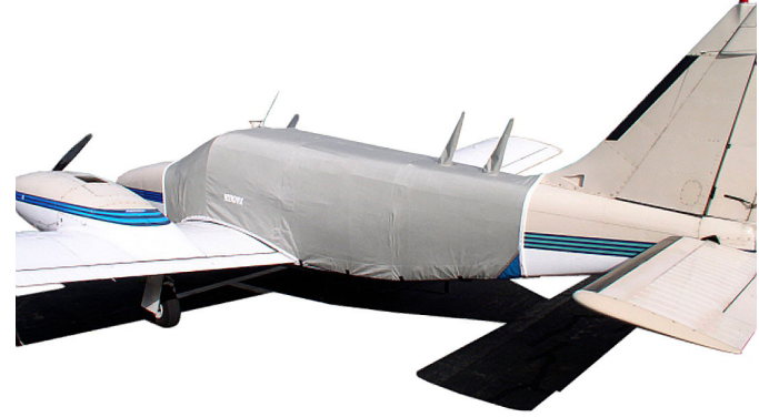
Piper Seneca Extended Canopy/Nose Cover