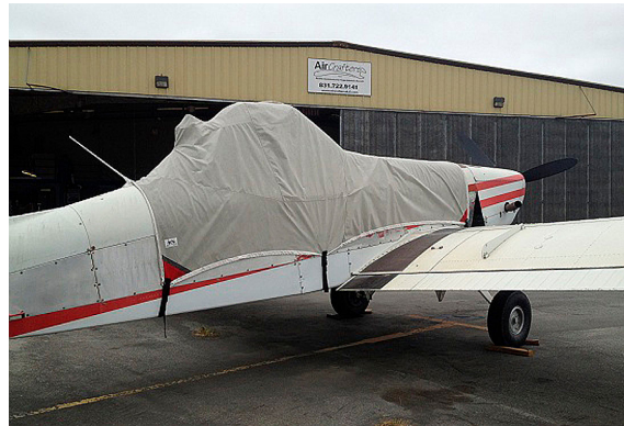
Piper Brave PA-36 Canopy/Hopper Cover