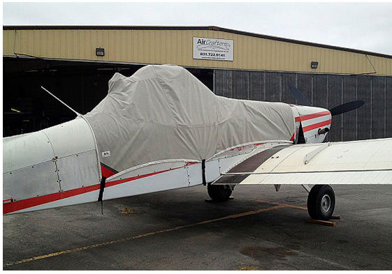
Piper Brave PA-36 Canopy/Hopper Cover