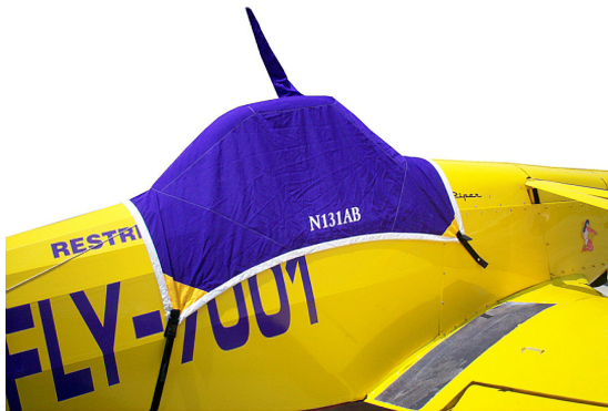
Piper Pawnee Canopy Cover

Travel Covers are made with Silver Solution-Dyed Polyester fabric and only lined over the windshield to save weight. The material is lightweight and more compact for easy stowage in the aircraft. The polyester material is water resistant, but only intended for occasional use outside. We also have an ultra lightweight material available for fitted hangar dust covers. For daily outdoor use, the non-travel Sunbrella Cover is the best choice.