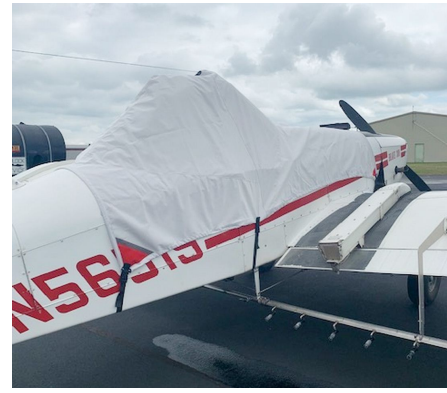
Piper Brave PA-36 Canopy/Hopper Cover