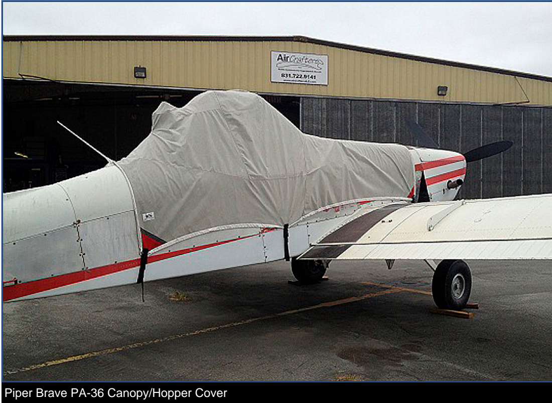
Piper Brave PA-36 Canopy/Hopper Cover