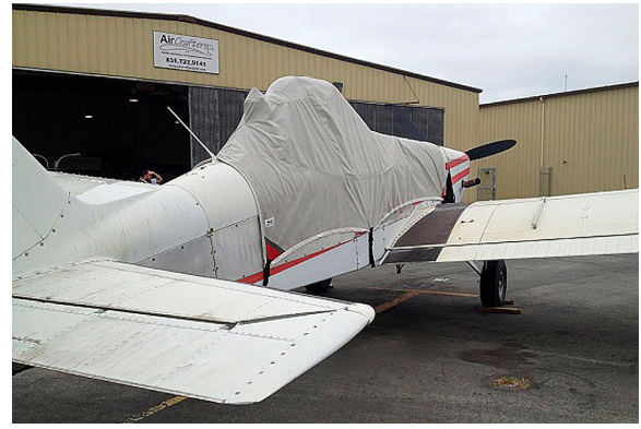
Piper Brave PA-36 Canopy/Hopper Cover