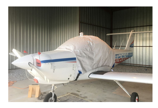
Piper PA-38 Canopy Cover