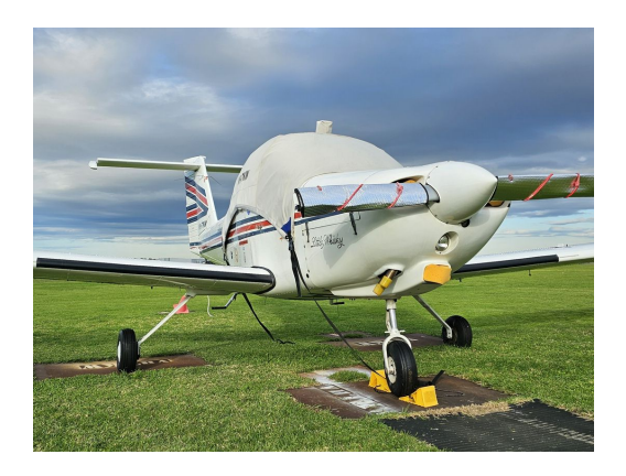
Piper PA-38 Tomahawk Canopy Cover

This cover type is made from Silver Acrylic Sunbrella canvas and is 100% lined with a soft and smooth microfiber. Bruce's Custom Covers developed this material combination especially for aircraft protection. The outer material is medium weight and treated for water resistance, UV resistance and anti-static buildup. The inner lining is a very soft and smooth microfiber to prevent scratching. The material is very reflective, and tests show that the cabin interior temperature can be reduced to near-ambient temperature on the hottest of days. It is water, ice and snow repellent, yet breathable to allow moisture to escape from between the cover and the aircraft surface.