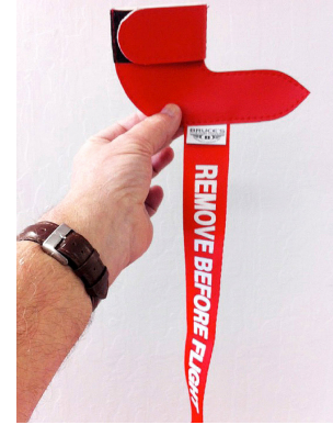
Standard Pitot Cover