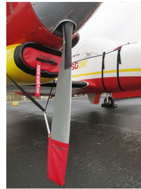
Piper PA-42 Cheyenne III Prop Tie/Exhaust Cover, Inlet Plugs