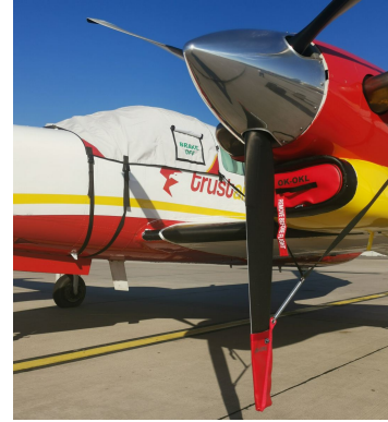
Piper PA-42 Cheyenne III Engine Plugs, Prop Ties, Cockpit Cover