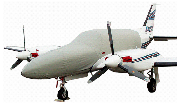
Piper Navajo CR Canopy/Nose Cover