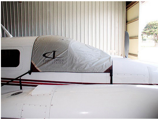
Piper Cheyenne Cockpit Cover

This cover type is made from Silver Acrylic Sunbrella canvas and is 100% lined with a soft and smooth microfiber. Bruce's Custom Covers developed this material combination especially for aircraft protection. The outer material is medium weight and treated for water resistance, UV resistance and anti-static buildup. The inner lining is a very soft and smooth microfiber to prevent scratching. The material is very reflective, and tests show that the cabin interior temperature can be reduced to near-ambient temperature on the hottest of days. It is water, ice and snow repellent, yet breathable to allow moisture to escape from between the cover and the aircraft surface.