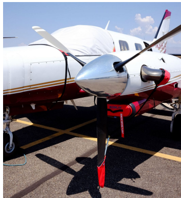
Piper Cheyenne Cockpit Cover, Engine Plugs, Prop Tie/Exhaust Covers

Travel Covers are made with Silver Solution-Dyed Polyester fabric and only lined over the windshield to save weight. The material is lightweight and more compact for easy stowage in the aircraft. The polyester material is water resistant, but only intended for occasional use outside. We also have an ultra lightweight material available for fitted hangar dust covers. For daily outdoor use, the non-travel Sunbrella Cover is the best choice.