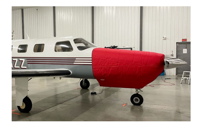
Malibu PA-46-310P Insulated Engine Cover

This cover type is made from Silver Acrylic Sunbrella canvas and is 100% lined with a soft and smooth microfiber. Bruce's Custom Covers developed this material combination especially for aircraft protection. The outer material is medium weight and treated for water resistance, UV resistance and anti-static buildup. The inner lining is a very soft and smooth microfiber to prevent scratching. The material is very reflective, and tests show that the cabin interior temperature can be reduced to near-ambient temperature on the hottest of days. It is water, ice and snow repellent, yet breathable to allow moisture to escape from between the cover and the aircraft surface.