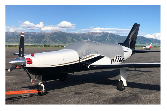
Piper Malibu/Mirage Windshield Cover