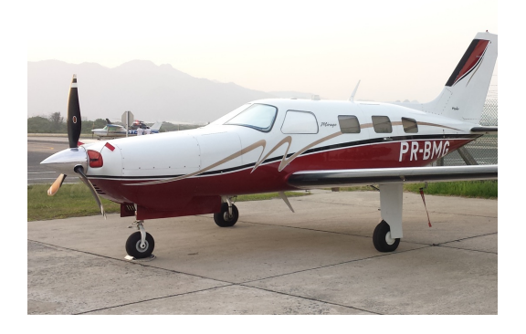
Piper Malibu/Mirage Engine Plugs, Cockpit HeatShields