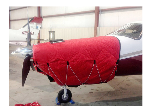
Piper PA-46 Insulated Engine Cover, fully enclosed with oil door flap