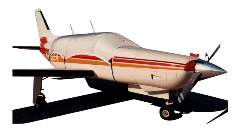
Piper Malibu/Mirage Standard Canopy Cover

Engine Inlet Plugs are custom fit for your Piper PA-46 Malibu intakes, made with heavy-duty vinyl material, and stuffed with a single block of sculpted urethane foam. Each plug has a zipper that allows the foam to be removed and dried if necessary. Engine plugs have warning flags that are visible from the cockpit or 'remove before flight' streamers sewn onto the face of the plugs. Most plugs are imprinted with the aircraft registration number in black for an extra charge. Storage bag NOT included. Engine plugs may be inserted after flight when the engine is still warm. Engine Inlet Plugs are commonly referred to as Cowl Plugs, Intake Plugs, Cowl Blocks, Engine Blocks, and Engine Bungs.