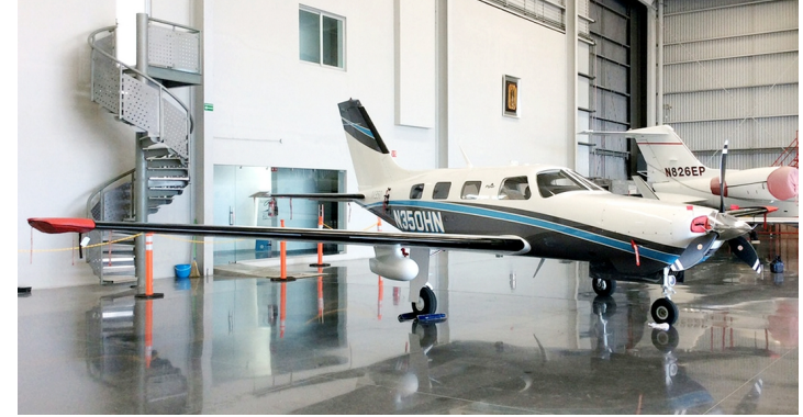
Piper PA-46 Malibu Wingtip Pads