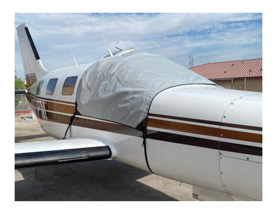
Piper PA46-310P Travel Weight Cockpit Cover