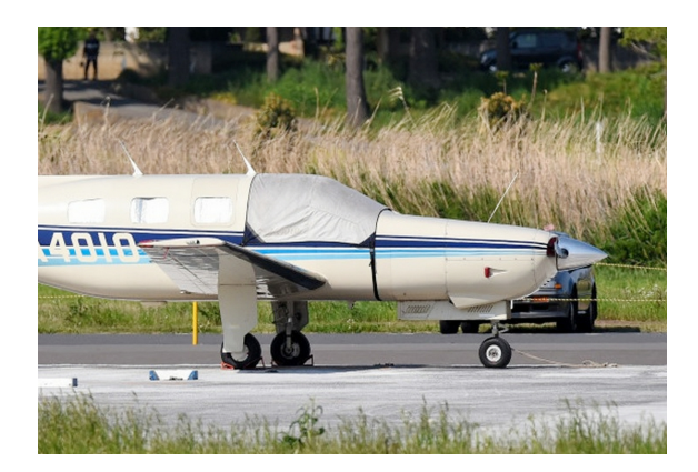
Piper PA-46 Cockpit Cover

This cover type is made from Silver Acrylic Sunbrella canvas and is 100% lined with a soft and smooth microfiber. Bruce's Custom Covers developed this material combination especially for aircraft protection. The outer material is medium weight and treated for water resistance, UV resistance and anti-static buildup. The inner lining is a very soft and smooth microfiber to prevent scratching. The material is very reflective, and tests show that the cabin interior temperature can be reduced to near-ambient temperature on the hottest of days. It is water, ice and snow repellent, yet breathable to allow moisture to escape from between the cover and the aircraft surface.