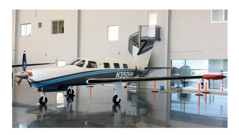
Piper PA-46 Malibu Wingtip Pads

Designed to prevent damage to the aircraft extremities in crowded hangars, these products are made of bright red Naugahyde and thickly padded with a sandwich of closed cell foam.