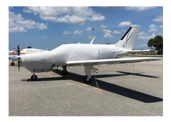
Piper PA 46-350P Horizontal Stabilizer/Tailcone Cover Piper Malibu Extended Canopy Cover, Engine, Wing & Horiz. Stab. Covers