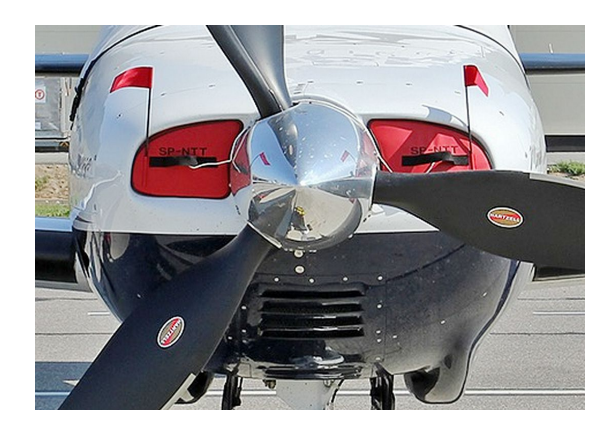
Piper PA-46-350P Mirage Engine Inlet Plugs