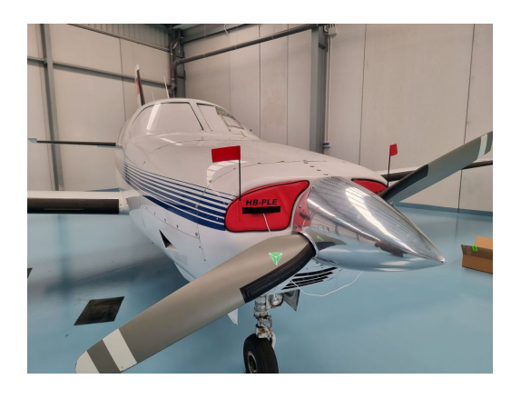
Piper PA-46 Malibu Engine Inlet Plugs