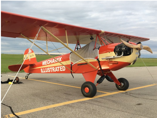
Corben Baby Ace Cockpit Cover

This cover type is made from Silver Acrylic Sunbrella canvas and is 100% lined with a soft and smooth microfiber. Bruce's Custom Covers developed this material combination especially for aircraft protection. The outer material is medium weight and treated for water resistance, UV resistance and anti-static buildup. The inner lining is a very soft and smooth microfiber to prevent scratching. The material is very reflective, and tests show that the cabin interior temperature can be reduced to near-ambient temperature on the hottest of days. It is water, ice and snow repellent, yet breathable to allow moisture to escape from between the cover and the aircraft surface.