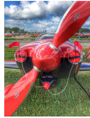
SPA Sport Panther Engine Plugs