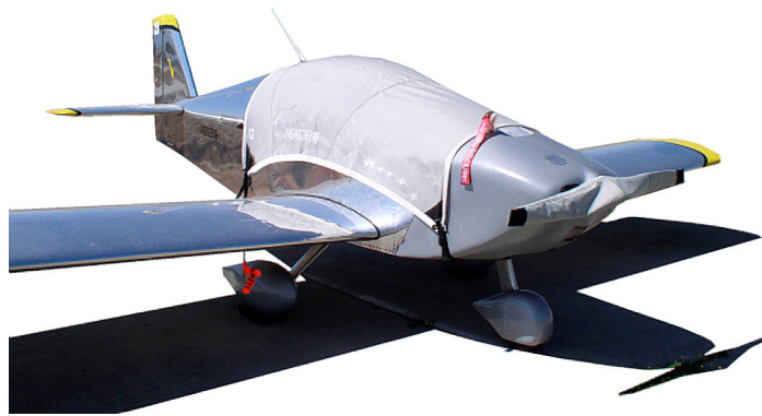
Sonex Canopy Cover

This cover type is made from Silver Acrylic Sunbrella canvas and is 100% lined with a soft and smooth microfiber. Bruce's Custom Covers developed this material combination especially for aircraft protection. The outer material is medium weight and treated for water resistance, UV resistance and anti-static buildup. The inner lining is a very soft and smooth microfiber to prevent scratching. The material is very reflective, and tests show that the cabin interior temperature can be reduced to near-ambient temperature on the hottest of days. It is water, ice and snow repellent, yet breathable to allow moisture to escape from between the cover and the aircraft surface.