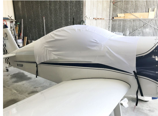
SPA, Sport Performance Aviation, Panther Canopy Cover (test fit cover)