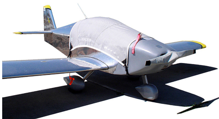
Sonex Canopy Cover

This cover type is made from Silver Acrylic Sunbrella canvas and is 100% lined with a soft and smooth microfiber. Bruce's Custom Covers developed this material combination especially for aircraft protection. The outer material is medium weight and treated for water resistance, UV resistance and anti-static buildup. The inner lining is a very soft and smooth microfiber to prevent scratching. The material is very reflective, and tests show that the cabin interior temperature can be reduced to near-ambient temperature on the hottest of days. It is water, ice and snow repellent, yet breathable to allow moisture to escape from between the cover and the aircraft surface.