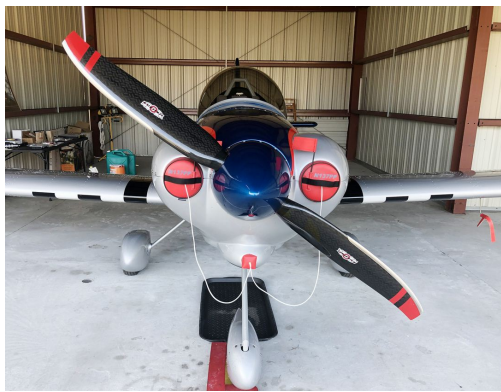
SPA Sport Panther Engine Inlet Plugs