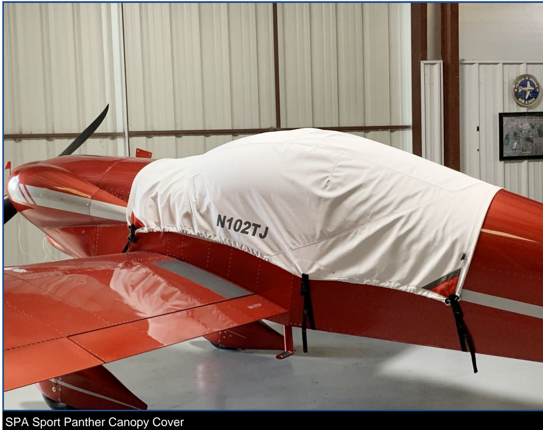
SPA Sport Panther Canopy Cover

(spa-sport-performance-aviation-PAN.pdf)