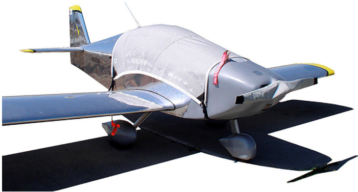
Sonex Canopy Cover

This cover type is made from Silver Acrylic Sunbrella canvas and is 100% lined with a soft and smooth microfiber. Bruce's Custom Covers developed this material combination especially for aircraft protection. The outer material is medium weight and treated for water resistance, UV resistance and anti-static buildup. The inner lining is a very soft and smooth microfiber to prevent scratching. The material is very reflective, and tests show that the cabin interior temperature can be reduced to near-ambient temperature on the hottest of days. It is water, ice and snow repellent, yet breathable to allow moisture to escape from between the cover and the aircraft surface.