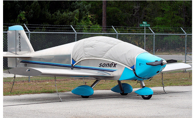
Sonex Canopy Cover