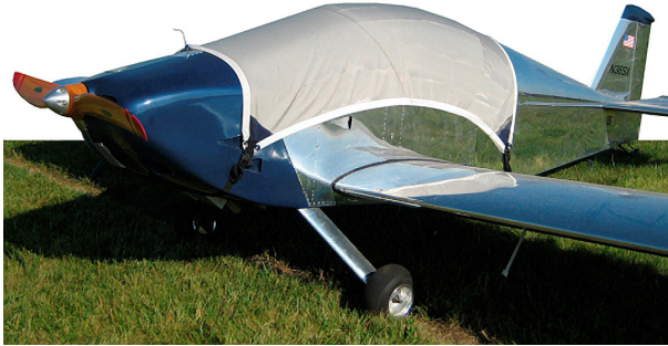
Sonex Canopy Cover

This cover type is made from Silver Acrylic Sunbrella canvas and is 100% lined with a soft and smooth microfiber. Bruce's Custom Covers developed this material combination especially for aircraft protection. The outer material is medium weight and treated for water resistance, UV resistance and anti-static buildup. The inner lining is a very soft and smooth microfiber to prevent scratching. The material is very reflective, and tests show that the cabin interior temperature can be reduced to near-ambient temperature on the hottest of days. It is water, ice and snow repellent, yet breathable to allow moisture to escape from between the cover and the aircraft surface.