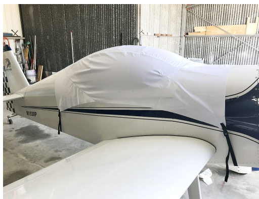
SPA, Sport Performance Aviation, Panther Canopy Cover (test fit cover)