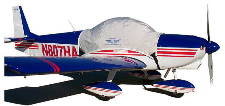
Pazmany PL2 Homebuilt Canopy Cover