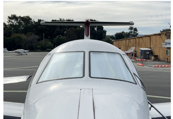
Pilatus PC-12 Cockpit HeatShields