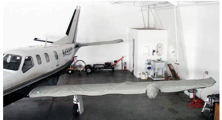
Pilatus PC-12 Wing Covers