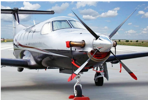
Pilatus PC-12 Engine Plugs, Prop Ties, Cockpit HeatShields

Engine Inlet Plugs are custom fit for your Pilatus PC-12, U-28A, NGX intakes, made with heavy-duty vinyl material, and stuffed with a single block of sculpted urethane foam. Each plug has a zipper that allows the foam to be removed and dried if necessary. Engine plugs have warning flags that are visible from the cockpit or 'remove before flight' streamers sewn onto the face of the plugs. Most plugs are imprinted with the aircraft registration number in black for an extra charge. Storage bag NOT included. Engine plugs may be inserted after flight when the engine is still warm. Engine Inlet Plugs are commonly referred to as Cowl Plugs, Intake Plugs, Cowl Blocks, Engine Blocks, and Engine Bunges.