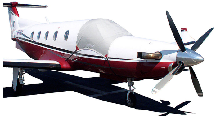
PC-12 Windshield Cover