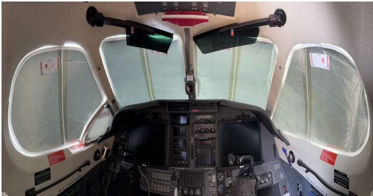
Pilatus PC-12 Cockpit HeatShields

Cockpit Heatshields are interior sunshades for the aircraft's cockpit. The product is a unique composite of closed-cell foam with a silver mylar finish. The semi-rigid design is stiff enough to stand inside the window framing. The set folds up flat and is easily stored in the included storage sleeve. Some designs may require velcro and suction cups. A Heatshield is an excellent short-term remedy for cockpit overheating, but an external fabric cover is more effective for long-term protection.