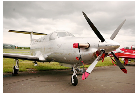
Main Intake Plug and Prop-Tie/Exhaust Covers. (Sold Separately)