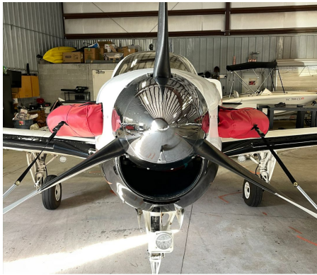
WH6 Harpoon Exhaust Covers/Prop Tie

This cover type is made from Silver Acrylic Sunbrella canvas and is 100% lined with a soft and smooth microfiber. Bruce's Custom Covers developed this material combination especially for aircraft protection. The outer material is medium weight and treated for water resistance, UV resistance and anti-static buildup. The inner lining is a very soft and smooth microfiber to prevent scratching. The material is very reflective, and tests show that the cabin interior temperature can be reduced to near-ambient temperature on the hottest of days. It is water, ice and snow repellent, yet breathable to allow moisture to escape from between the cover and the aircraft surface.