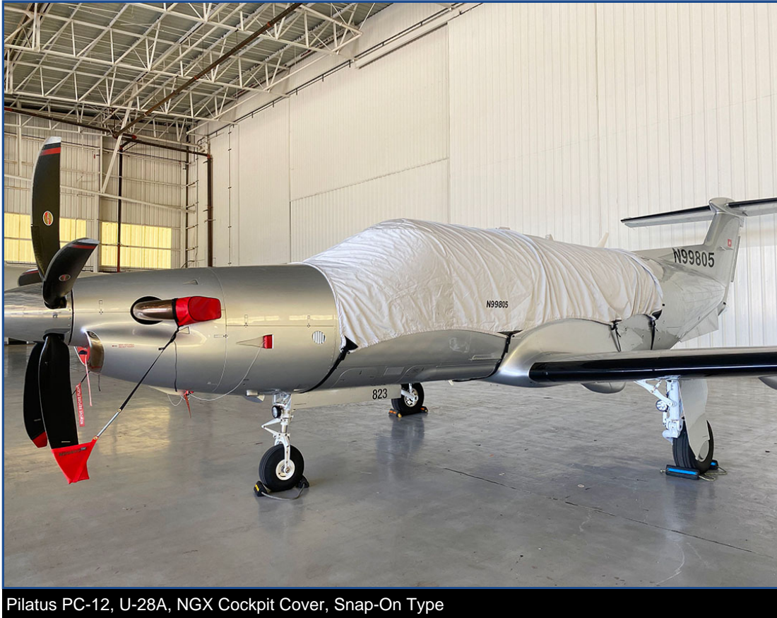
Pilatus PC-12, U-28A, NGX Cockpit Cover, Snap-On Type