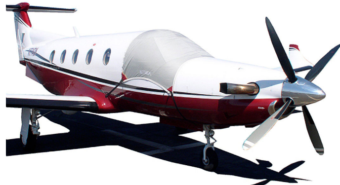
PC-12 Windshield Cover