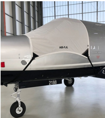
Pilatus PC-12 Cockpit Cover

This cover type is made from Silver Acrylic Sunbrella canvas and is 100% lined with a soft and smooth microfiber. Bruce's Custom Covers developed this material combination especially for aircraft protection. The outer material is medium weight and treated for water resistance, UV resistance and anti-static buildup. The inner lining is a very soft and smooth microfiber to prevent scratching. The material is very reflective, and tests show that the cabin interior temperature can be reduced to near-ambient temperature on the hottest of days. It is water, ice and snow repellent, yet breathable to allow moisture to escape from between the cover and the aircraft surface.