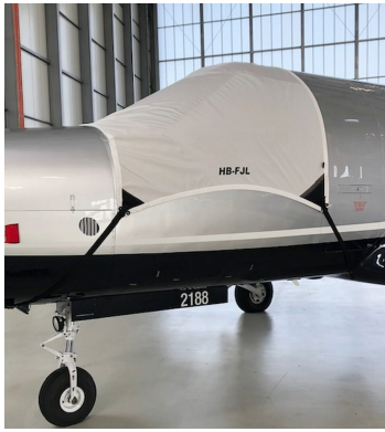
Pilatus PC-12 Cockpit Cover