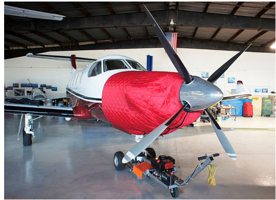
Pilatus PC-12 Insulated Engine Cover