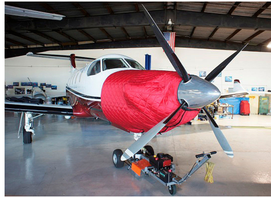
Pilatus PC-12 Insulated Engine Cover