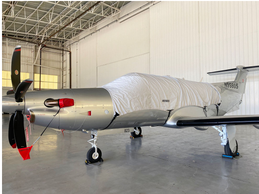
Pilatus PC-12, U-28A, NGX Cockpit Cover, Snap-On Type

This cover type is made from Silver Acrylic Sunbrella canvas and is 100% lined with a soft and smooth microfiber. Bruce's Custom Covers developed this material combination especially for aircraft protection. The outer material is medium weight and treated for water resistance, UV resistance and anti-static buildup. The inner lining is a very soft and smooth microfiber to prevent scratching. The material is very reflective, and tests show that the cabin interior temperature can be reduced to near-ambient temperature on the hottest of days. It is water, ice and snow repellent, yet breathable to allow moisture to escape from between the cover and the aircraft surface.