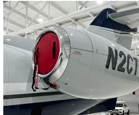
Pilatus PC-24 Engine Inlet Plugs