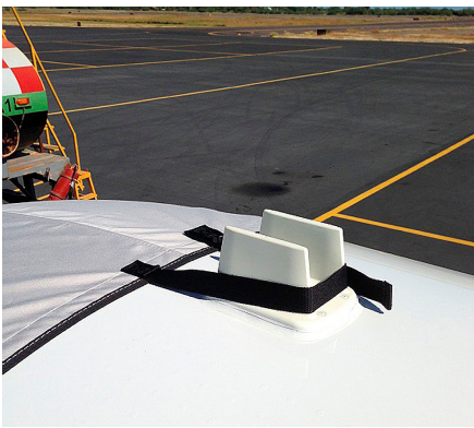
Phenom 100 EMB-500 Cockpit Cover (includes straps to hook around traffic antennae so the cover will not slip forward)