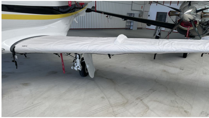
Embraer Phenom 100 Canopy/Nose Cover