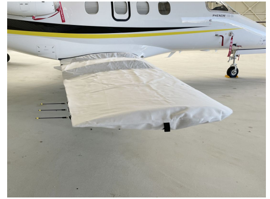
Embraer Phenom 100 Canopy/Nose Cover