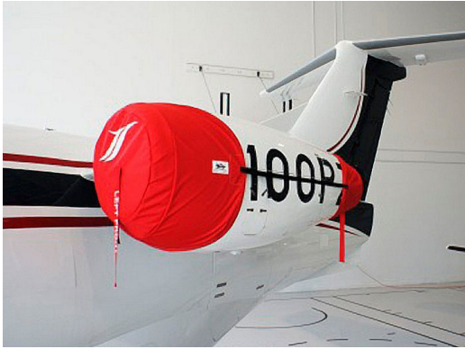
Phenom 100 Tri-fold style Engine Cover Set

Engine Inlet Plugs are commonly referred to as Cowl Plugs, Intake Plugs, Cowl Blocks, Engine Blocks, and Engine Bungs.