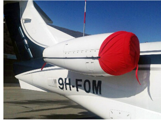
Embraer Phenom Engine Intake Covers & Exhaust Plugs