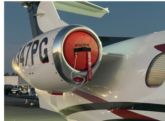
Embraer Phenom 100 Intake & Exhaust Plugs