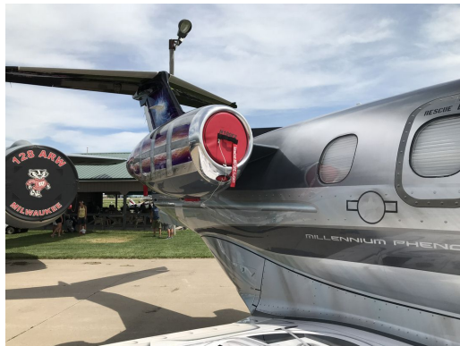
Embraer Phenom I Engine Inlet Plugs

The Engine Inlet Plugs are custom fit for your Embraer Phenom 100 (EMB-500) intakes, made with heavy-duty vinyl material, and stuffed with a single block of sculpted urethane foam. Each plug has a zipper that allows the foam to be removed and dried if necessary. Engine plugs have 'remove before flight' streamers sewn onto the face of the plugs. Most plugs are imprinted with the aircraft registration number in black for an extra charge. Storage bag NOT included. Engine plugs may be inserted after flight when the engine is still warm. Engine Inlet Plugs are commonly referred to as Cowl Plugs, Intake Plugs, Cowl Blocks, Engine Blocks, and Engine Bungs.