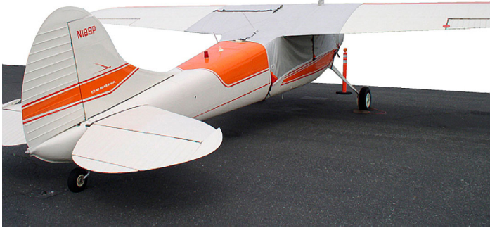
Cessna 195 Over-Top Canopy, Engine & Prop Covers

water resistance, UV resistance and anti-static buildup. The inner lining is a very soft and smooth microfiber to prevent scratching. The material is very reflective, and tests show that the cabin interior temperature can be reduced to near-ambient temperature on the hottest of days. It is water, ice and snow repellent, yet breathable to allow moisture to escape from between the cover and the aircraft surface.