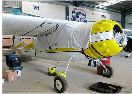
Cessna 195 Canopy Cover, over-top, 24" fwd ext to cover cowl ring gap, gas cap ext.