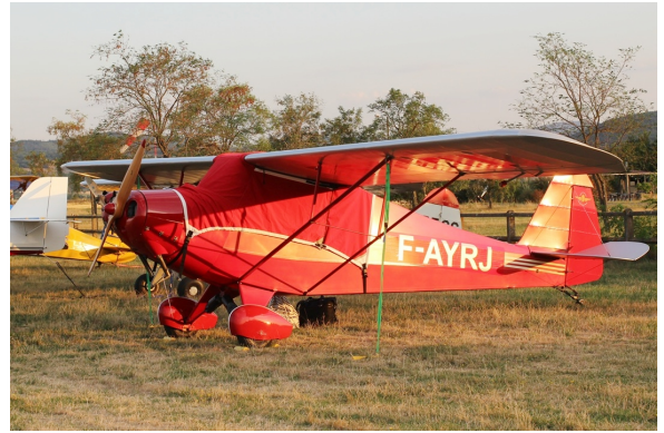
Porterfield Collegiate Canopy Cover