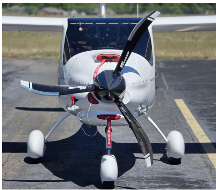
Pipistrel Virus SW