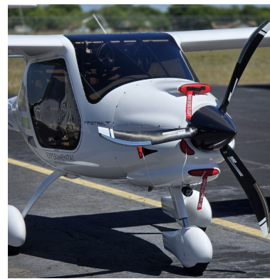
Pipistrel Virus SW