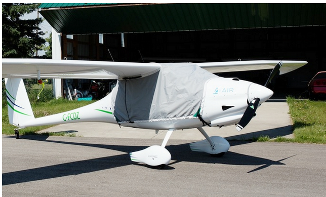
Pipistrel Light Weight Travel Canopy Cover

Travel Covers are made with Silver Solution-Dyed Polyester fabric and only lined over the windshield to save weight. The material is lightweight and more compact for easy stowage in the aircraft. The polyester material is water resistant, but only intended for occasional use outside. We also have an ultra lightweight material available for fitted hangar dust covers. For daily outdoor use, the non-travel Sunbrella Cover is the best choice.