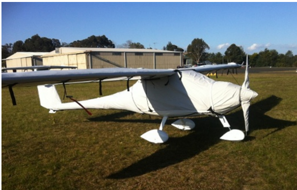
Pipistrel Full Cover Set

WINTER USE MATERIAL - Made with Solution-Dyed Polyester fabric, this option is intended for seasonal use to aid in deicing, rain mitigation, or for occasional travel. The material is lighter and more compact, but more susceptible to UV damage and may have a shorter useful life if used continuously outside than the all-year use material.