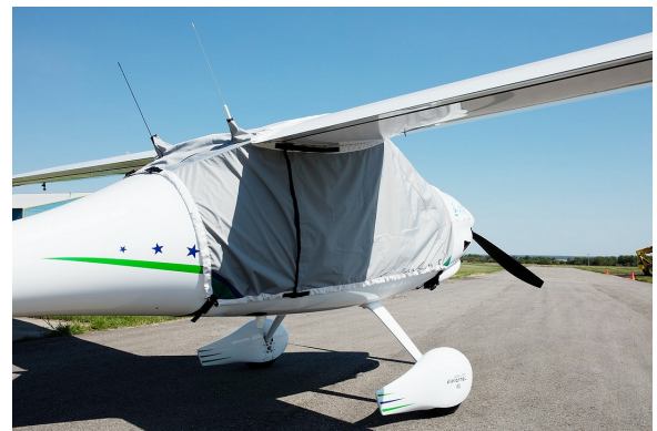
Pipistrel Light Weight Travel Canopy Cover