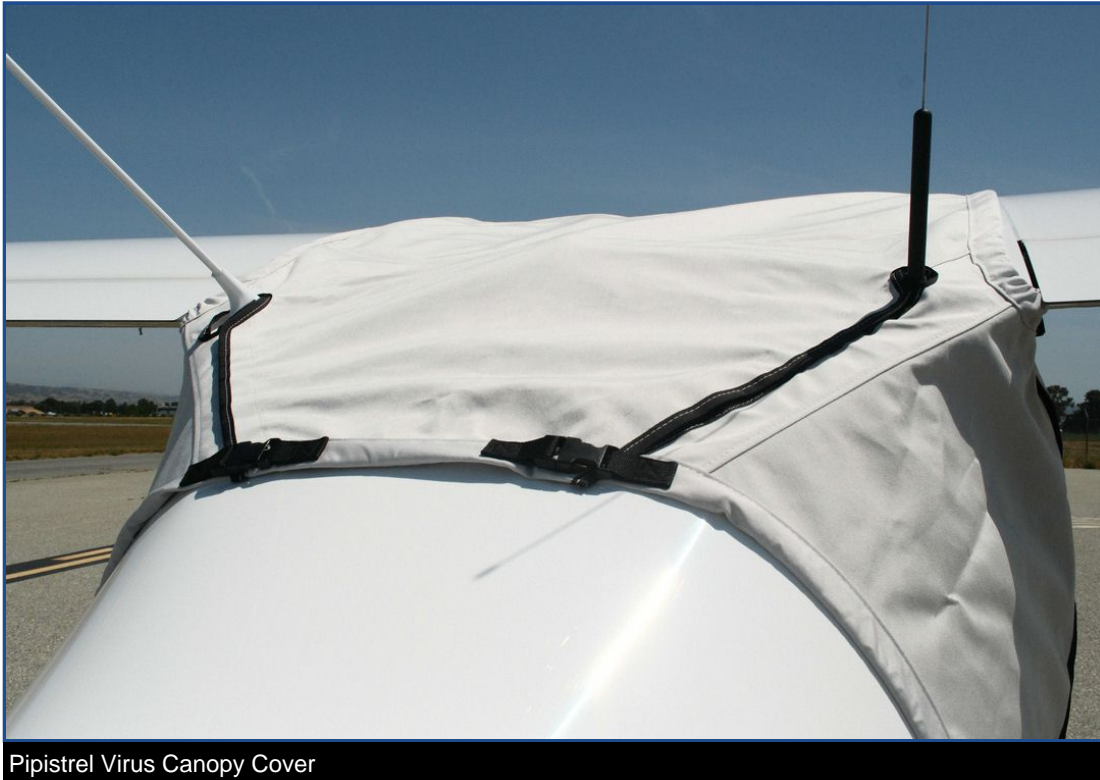
Pipistrel Virus Canopy Cover