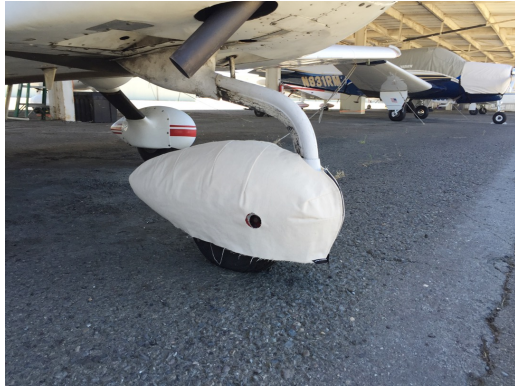
Grumman AA5 Nose Wheelpant Cover, test fit

normally made with Solution-Dyed Polyester or Acrylic Sunbrella .