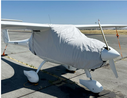
Pipistrel Virus SW Canopy/Engine Cover

This cover type is made from Silver Acrylic Sunbrella canvas and is 100% lined with a soft and smooth microfiber. Bruce's Custom Covers developed this material combination especially for aircraft protection. The outer material is medium weight and treated for water resistance, UV resistance and anti-static buildup. The inner lining is a very soft and smooth microfiber to prevent scratching. The material is very reflective, and tests show that the cabin interior temperature can be reduced to near-ambient temperature on the hottest of days. It is water, ice and snow repellent, yet breathable to allow moisture to escape from between the cover and the aircraft surface.