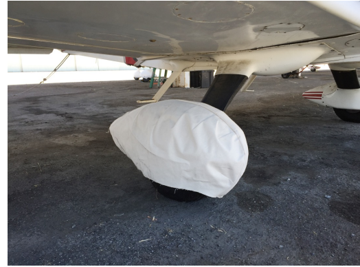
Grumman AA5 Main Wheelpant Cover, test fit