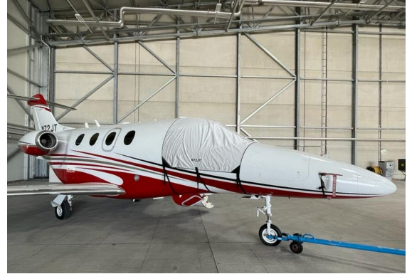
Hawker Premier Cockpit Cover