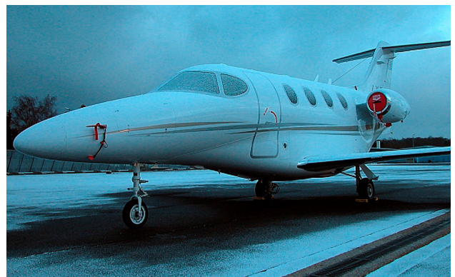
Premier Intake Plugs & Pitot Covers