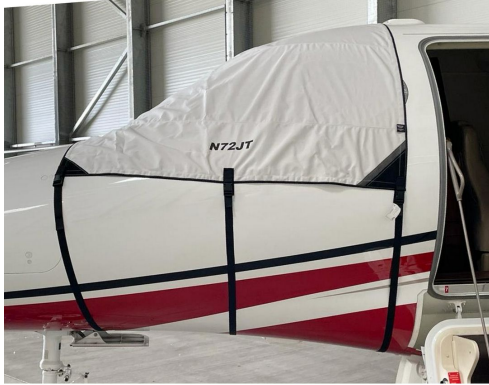
Hawker Premier Cockpit Cover

This cover type is made from Silver Acrylic Sunbrella canvas and is 100% lined with a soft and smooth microfiber. Bruce's Custom Covers developed this material combination especially for aircraft protection. The outer material is medium weight and treated for water resistance, UV resistance and anti-static buildup. The inner lining is a very soft and smooth microfiber to prevent scratching. The material is very reflective, and tests show that the cabin interior temperature can be reduced to near-ambient temperature on the hottest of days. It is water, ice and snow repellent, yet breathable to allow moisture to escape from between the cover and the aircraft surface.