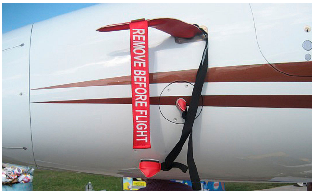
Premier Heat Resistant Pitot Covers set

The Hawker Beechcraft Premier 390 Intake/Exhaust Plugs are custom fit for the intake and exhaust openings, made with heavy-duty vinyl material, and stuffed with a single block of sculpted urethane foam. Each plug has a zipper that allows the foam to be removed and dried if necessary. Engine plugs have 'remove before flight' streamers sewn onto the face of the plugs. Most plugs are imprinted with the aircraft registration number in black. Engine plugs may be inserted after flight when the engine is still warm. Engine Inlet Plugs are commonly referred to as Cowl Plugs, Intake Plugs, Cowl Blocks, Engine Blocks, and Engine Bungs.