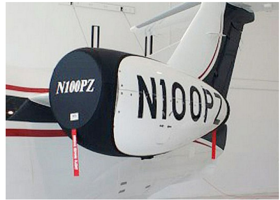
Phenom 100 "Bikini" Engine Covers