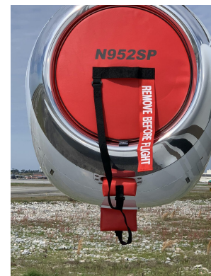
Beech Premier 1A Intake/Exhaust Plug Set