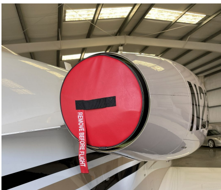
Hawker Beechcraft Premier 390 Intake Plug/Exhaust Plug Set

The Hawker Beechcraft Premier 390 Intake/Exhaust Plugs are custom fit for the intake and exhaust openings, made with heavy-duty vinyl material, and stuffed with a single block of sculpted urethane foam. Each plug has a zipper that allows the foam to be removed and dried if necessary. Engine plugs have 'remove before flight' streamers sewn onto the face of the plugs. Most plugs are imprinted with the aircraft registration number in black. Engine plugs may be inserted after flight when the engine is still warm. Engine Inlet Plugs are commonly referred to as Cowl Plugs, Intake Plugs, Cowl Blocks, Engine Blocks, and Engine Bungs.