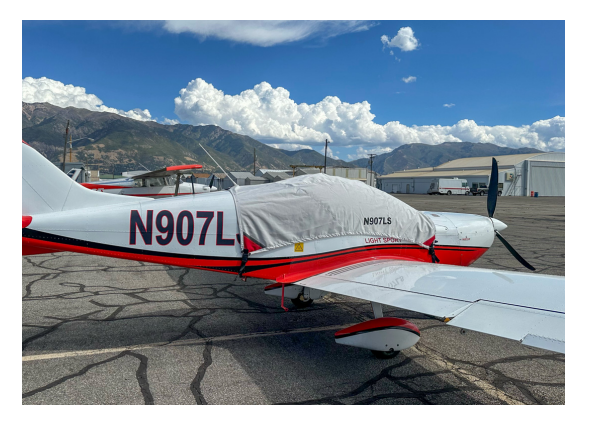
Piper PiperSport Canopy Cover