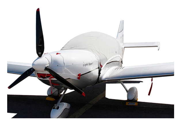
ENGINE PLUGS PREVENT BIRD NEST FOD. Piper Saratoga Engine Cowling Bird's Nest