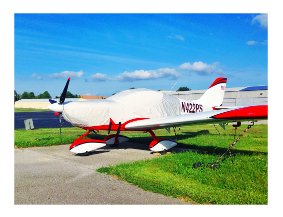
SportCruiser Canopy/Engine Cover

Travel Covers are made with Silver Solution-Dyed Polyester fabric and only lined over the windshield to save weight. The material is lightweight and more compact for easy stowage in the aircraft. The polyester material is water resistant, but only intended for occasional use outside. We also have an ultra lightweight material available for fitted hangar dust covers. For daily outdoor use, the non-travel Sunbrella Cover is the best choice.