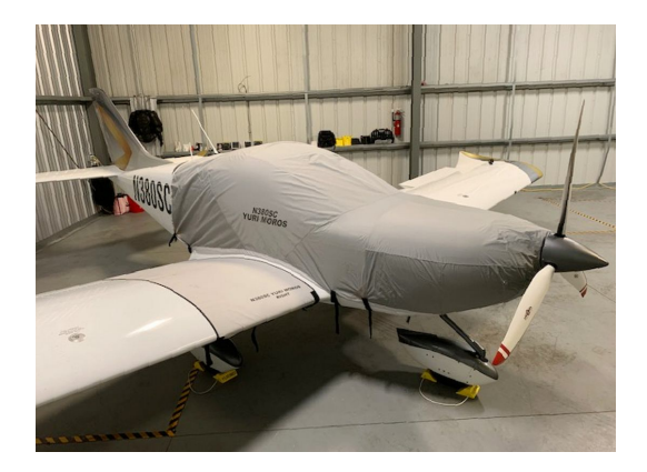
Czech Sport Travel Light Weight Canopy/Engine Cover, Wing Locker Covers