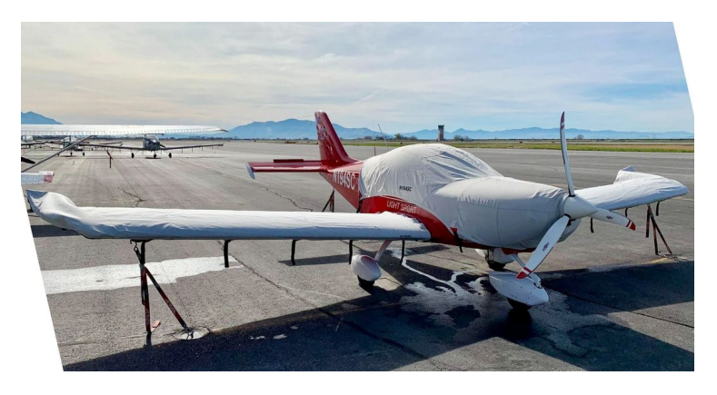
Czech Sport Canopy/Engine & Wing Covers

This cover type is made from Silver Acrylic Sunbrella canvas and is 100% lined with a soft and smooth microfiber. Bruce's Custom Covers developed this material combination especially for aircraft protection. The outer material is medium weight and treated for water resistance, UV resistance and anti-static buildup. The inner lining is a very soft and smooth microfiber to prevent scratching. The material is very reflective, and tests show that the cabin interior temperature can be reduced to near-ambient temperature on the hottest of days. It is water, ice and snow repellent, yet breathable to allow moisture to escape from between the cover and the aircraft surface.