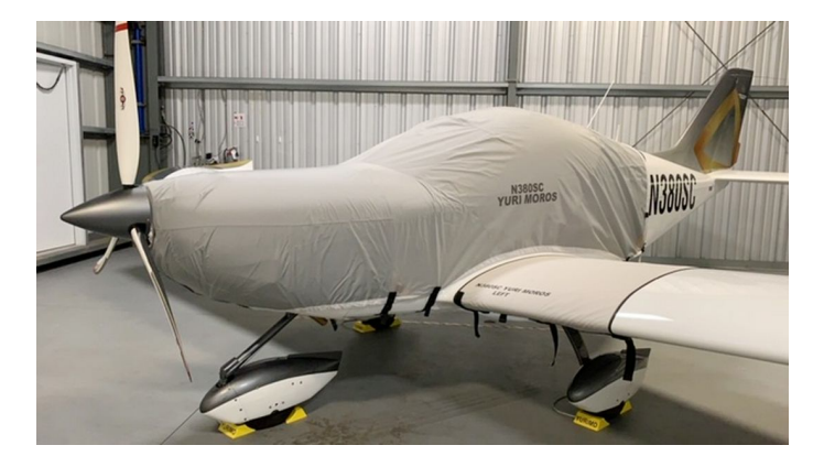
Czech Sport Travel Light Weight Canopy/Engine Cover, Wing Locker Covers

WINTER USE MATERIAL - Made with Solution-Dyed Polyester fabric, this option is intended for seasonal use to aid in deicing, rain mitigation, or for occasional travel. The material is lighter and more compact, but more susceptible to UV damage and may have a shorter useful life if used continuously outside than the all-year use material.