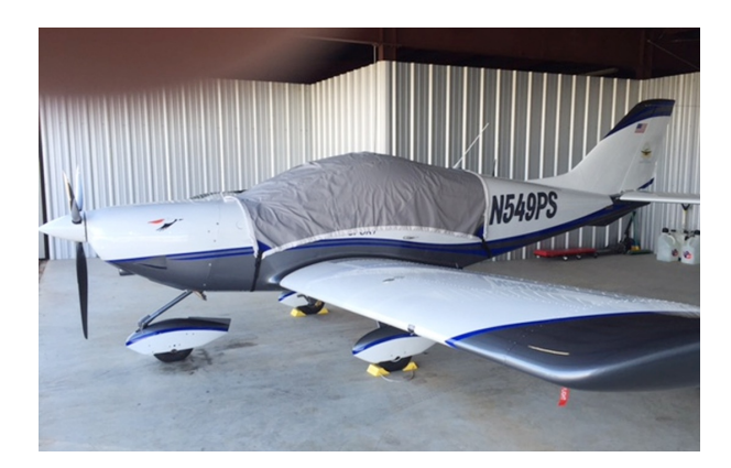
PiperSport Light Weight Travel Cover