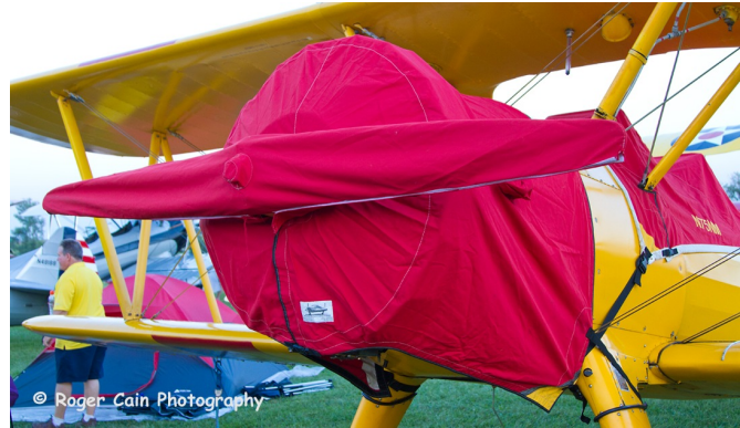
Boeing Stearman PT-13 Engine & Prop Covers (std. color is silver)