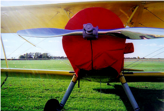
Stearman Engine Cover

This cover type is made from Silver Acrylic Sunbrella canvas and is 100% lined with a soft and smooth microfiber. Bruce's Custom Covers developed this material combination especially for aircraft protection. The outer material is medium weight and treated for water resistance, UV resistance and anti-static buildup. The inner lining is a very soft and smooth microfiber to prevent scratching. The material is very reflective, and tests show that the cabin interior temperature can be reduced to near-ambient temperature on the hottest of days. It is water, ice and snow repellent, yet breathable to allow moisture to escape from between the cover and the aircraft surface.