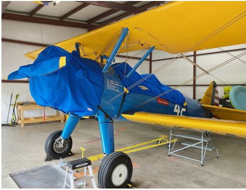
Stearman Canopy, Engine & Prop Covers

the hottest of days. It is water, ice and snow repellent, yet breathable to allow moisture to escape from between the cover and the aircraft surface.