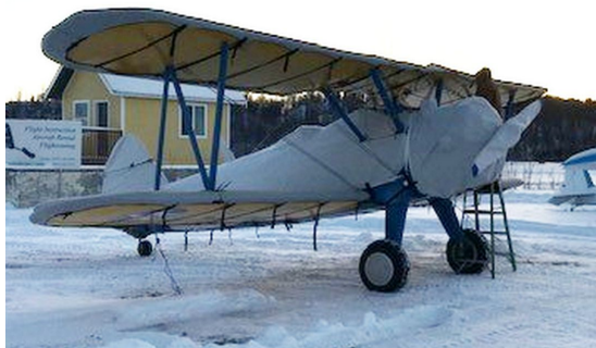
Boeing Stearman PT-13 Winter Cover Set

WINTER USE MATERIAL - Made with Solution-Dyed Polyester fabric, this option is intended for seasonal use to aid in deicing, rain mitigation, or for occasional travel. The material is lighter and more compact, but more susceptible to UV damage and may have a shorter useful life if used continuously outside than the all-year use material.