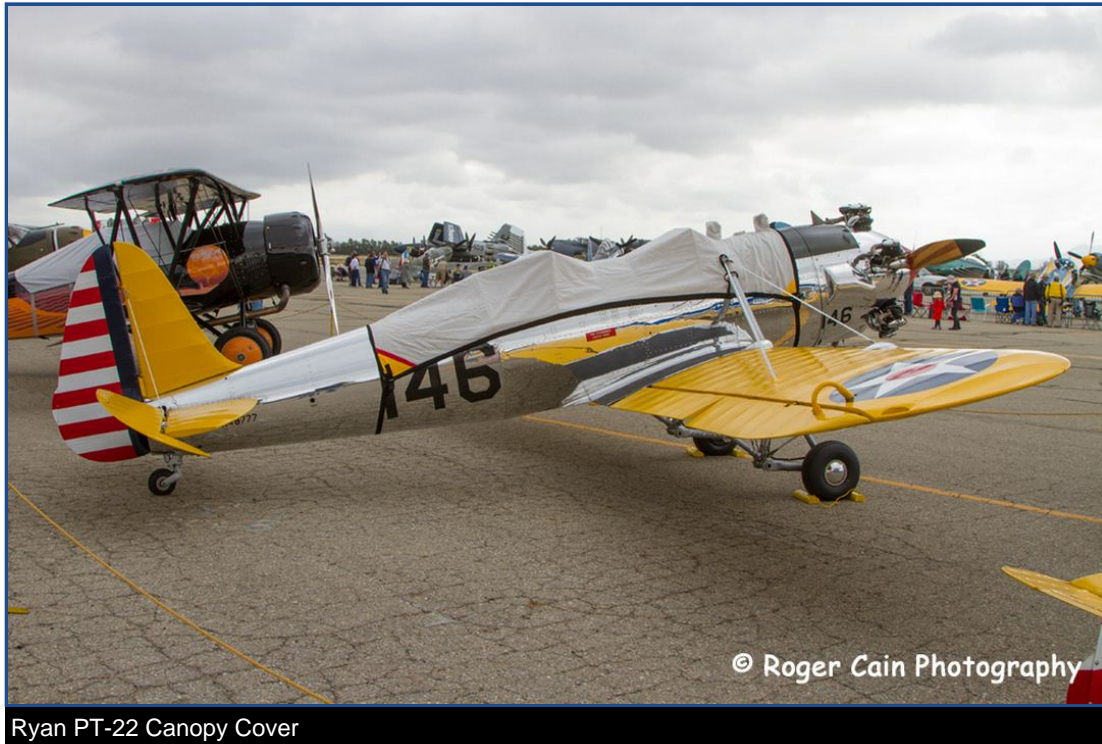
Ryan PT-22 Canopy Cover