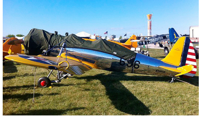
Ryan PT-22 ST3KR Canopy Cover and Engine Cover