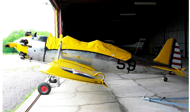
Ryan PT-22 Canopy Cover