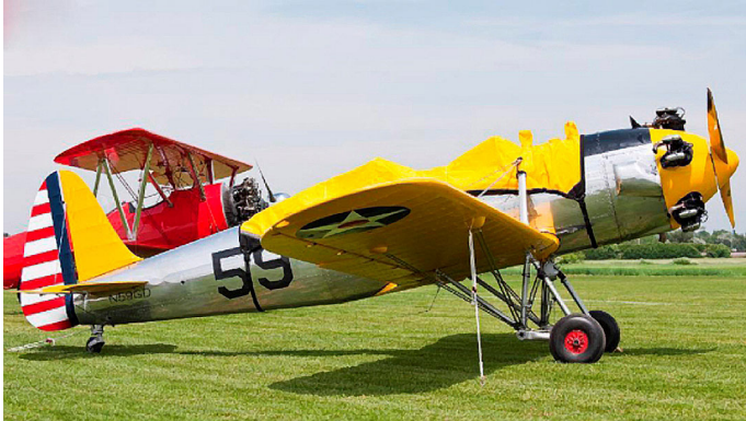
The Ryan PT-22 Canopy Cover

This cover type is made from Silver Acrylic Sunbrella canvas and is 100% lined with a soft and smooth microfiber. Bruce's Custom Covers developed this material combination especially for aircraft protection. The outer material is medium weight and treated for water resistance, UV resistance and anti-static buildup. The inner lining is a very soft and smooth microfiber to prevent scratching. The material is very reflective, and tests show that the cabin interior temperature can be reduced to near-ambient temperature on the hottest of days. It is water, ice and snow repellent, yet breathable to allow moisture to escape from between the cover and the aircraft surface.