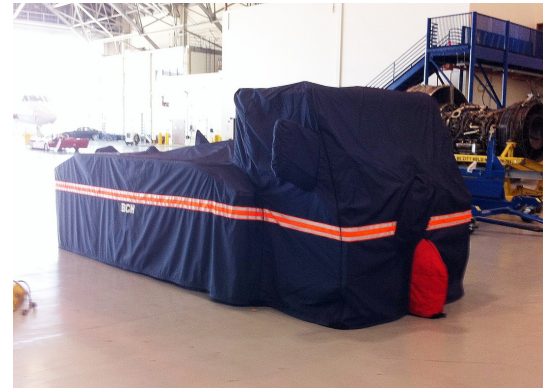
Complete Cover for Eagle Tug