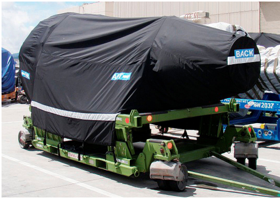
PW 2000 SERIES OFF-LINK ENGINE COVER, "rain cap" style