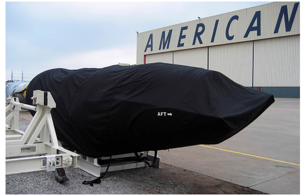
PW JT8D Off-Link Protective Long-term Storage "Rain Cap" Engine Cover