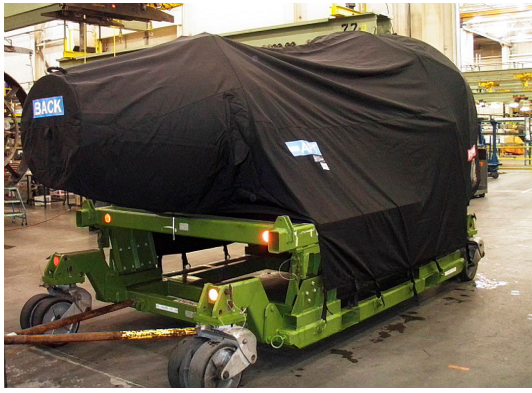
PW 2000 Series OFF-LINK ENGINE STORAGE COVER, Rain Cap