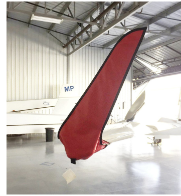
Schleicher ASH Wingtip Pads