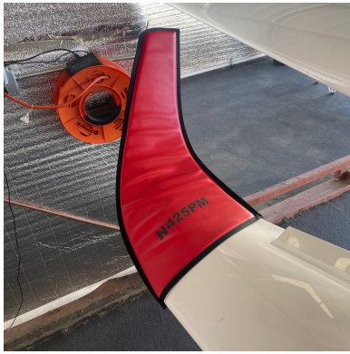
Stemme S-10 & S-12 Wingtip Pads