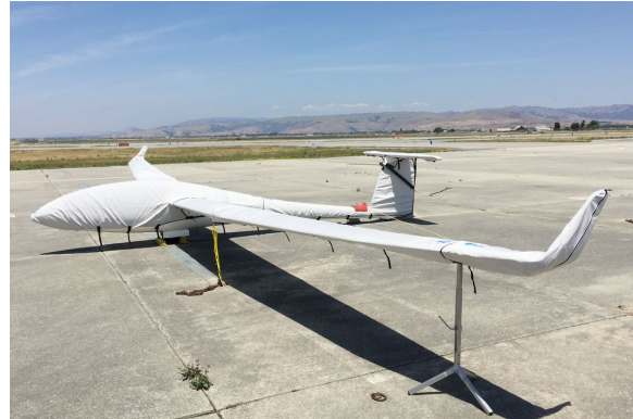
Schempp-Hirth Discus 2B Full Cover Set