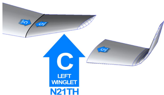
Sailplane Full Cover Set Graphic Indicators (Discus 2B, 3D model)

WINTER USE MATERIAL - Made with Solution-Dyed Polyester fabric, this option is intended for seasonal use to aid in deicing, rain mitigation, or for occasional travel. The material is lighter and more compact, but more susceptible to UV damage and may have a shorter useful life if used continuously outside than the all-year use material.