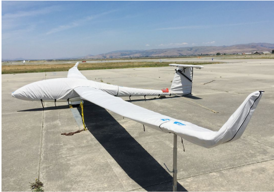
Schempp-Hirth Discus 2B Full Cover Set

This cover type is made from Silver Acrylic Sunbrella canvas and is 100% lined with a soft and smooth microfiber. Bruce's Custom Covers developed this material combination especially for aircraft protection. The outer material is medium weight and treated for water resistance, UV resistance and anti-static buildup. The inner lining is a very soft and smooth microfiber to prevent scratching. The material is very reflective, and tests show that the cabin interior temperature can be reduced to near-ambient temperature on the hottest of days. It is water, ice and snow repellent, yet breathable to allow moisture to escape from between the cover and the aircraft surface.