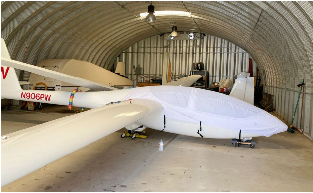
PZL Swidnik PW6 Canopy/Nose Cover