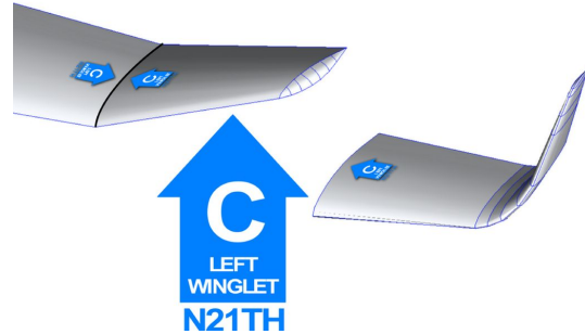
Sailplane Full Cover Set Graphic Indicators (Discus 2B, 3D model)