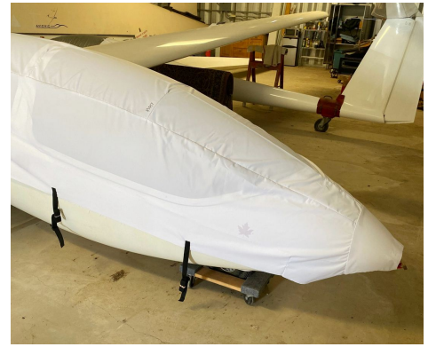
PZL Swidnik PW6 Canopy/Nose Cover