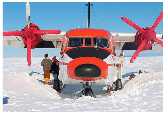
Casa 212 Insulated Engine & Propellor/Spinner Covers