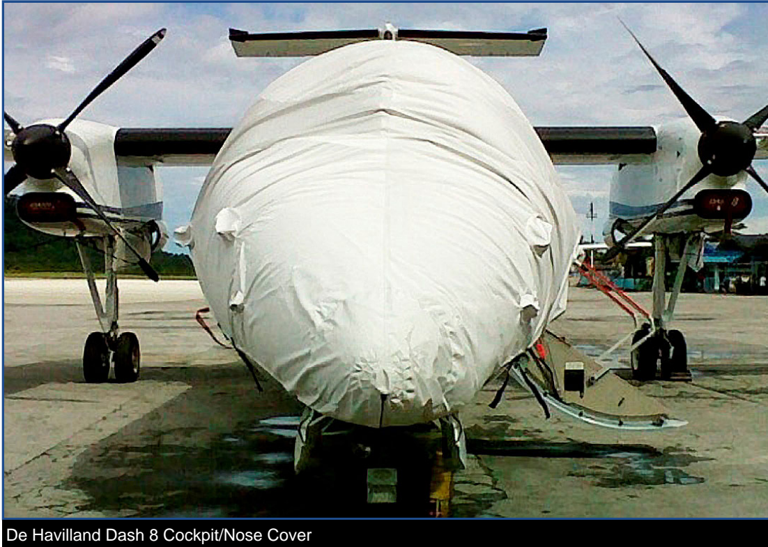
De Havilland Dash 8 Cockpit/Nose Cover