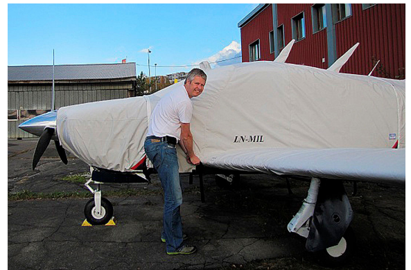
Rockwell Commander 114 Full Cover Set