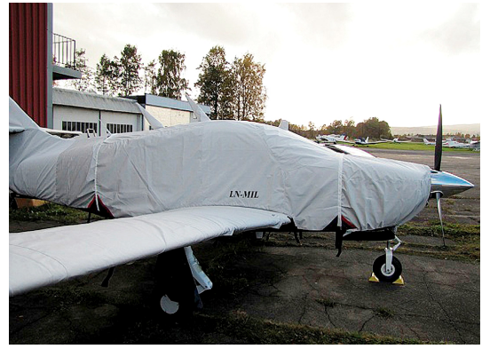
Rockwell Commander Engine, Extended Canopy, Wings, & Empennage Covers