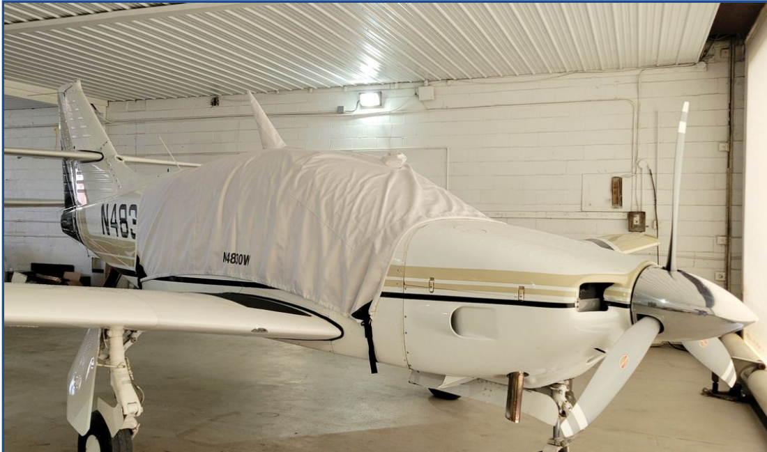
Rockwell Aero Commander 114 Canopy Cover