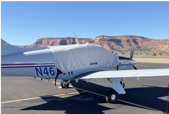
Rockwell Commander 112TC Canopy Cover

This cover type is made from Silver Acrylic Sunbrella canvas and is 100% lined with a soft and smooth microfiber. Bruce's Custom Covers developed this material combination especially for aircraft protection. The outer material is medium weight and treated for water resistance, UV resistance and anti-static buildup. The inner lining is a very soft and smooth microfiber to prevent scratching. The material is very reflective, and tests show that the cabin interior temperature can be reduced to near-ambient temperature on the hottest of days. It is water, ice and snow repellent, yet breathable to allow moisture to escape from between the cover and the aircraft surface.