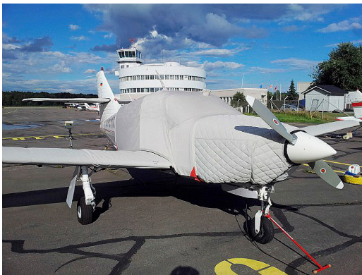
Rockwell Commander 114 Extended Canopy, Insulated Engine, Wing Covers

This cover type is made from Silver Acrylic Sunbrella canvas and is 100% lined with a soft and smooth microfiber. Bruce's Custom Covers developed this material combination especially for aircraft protection. The outer material is medium weight and treated for water resistance, UV resistance and anti-static buildup. The inner lining is a very soft and smooth microfiber to prevent scratching. The material is very reflective, and tests show that the cabin interior temperature can be reduced to near-ambient temperature on the hottest of days. It is water, ice and snow repellent, yet breathable to allow moisture to escape from between the cover and the aircraft surface.