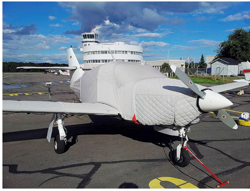
Rockwell Commander 114 Extended Canopy, Insulated Engine, Wing Covers