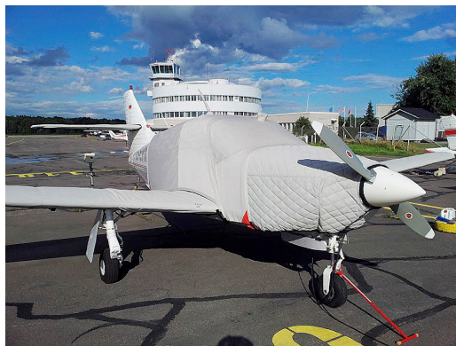
Rockwell Commander 114 Extended Canopy, Insulated Engine, Wing Covers

This cover type is made from Silver Acrylic Sunbrella canvas and is 100% lined with a soft and smooth microfiber. Bruce's Custom Covers developed this material combination especially for aircraft protection. The outer material is medium weight and treated for water resistance, UV resistance and anti-static buildup. The inner lining is a very soft and smooth microfiber to prevent scratching. The material is very reflective, and tests show that the cabin interior temperature can be reduced to near-ambient temperature on the hottest of days. It is water, ice and snow repellent, yet breathable to allow moisture to escape from between the cover and the aircraft surface.