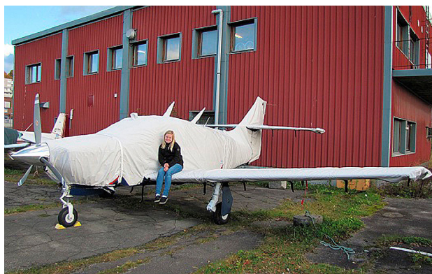
Rockwell 114 Canopy Cover & Wing Covers