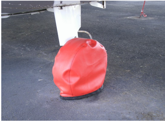
Piper PA28-140 Tire Covers

ALL-YEAR USE MATERIAL - Made with Silver Acrylic Sunbrella canvas, the all-year use material is the best option for sun protection and cover longevity. This heavier more durable material is intended for all weather conditions, such as rain and snow or lots of sun.