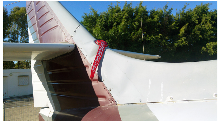
Rockwell Aero Commander 112, 114 Engine Inlet Plugs (114 Model)