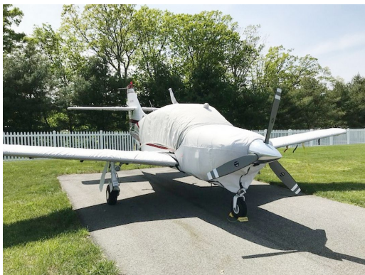
Rockwell Commander 114A Canopy, Engine, Wings & Horizontal Stab. Covers

This cover type is made from Silver Acrylic Sunbrella canvas and is 100% lined with a soft and smooth microfiber. Bruce's Custom Covers developed this material combination especially for aircraft protection. The outer material is medium weight and treated for water resistance, UV resistance and anti-static buildup. The inner lining is a very soft and smooth microfiber to prevent scratching. The material is very reflective, and tests show that the cabin interior temperature can be reduced to near-ambient temperature on the hottest of days. It is water, ice and snow repellent, yet breathable to allow moisture to escape from between the cover and the aircraft surface.