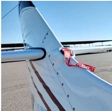
Rockwell Aero Commander 114 Dorsal Inlet Plug

Engine Inlet Plugs are custom fit for your Rockwell Aero Commander 112, 114 intakes, made with heavy-duty vinyl material, and stuffed with a single block of sculpted urethane foam. Each plug has a zipper that allows the foam to be removed and dried if necessary. Engine plugs have warning flags that are visible from the cockpit or 'remove before flight' streamers sewn onto the face of the plugs. Most plugs are imprinted with the aircraft registration number in black for an extra charge. Storage bag NOT included. Engine plugs may be inserted after flight when the engine is still warm. Engine Inlet Plugs are commonly referred to as Cowl Plugs, Intake Plugs, Cowl Blocks, Engine Blocks, and Engine Bunges.