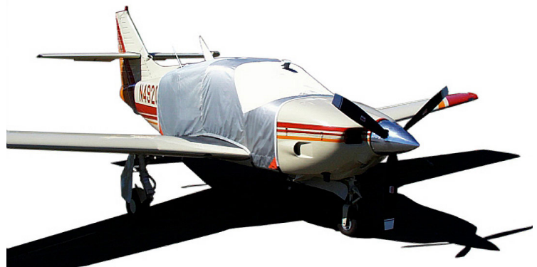
Extended Canopy Cover