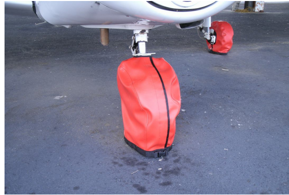
Piper PA28-140 Tire Covers