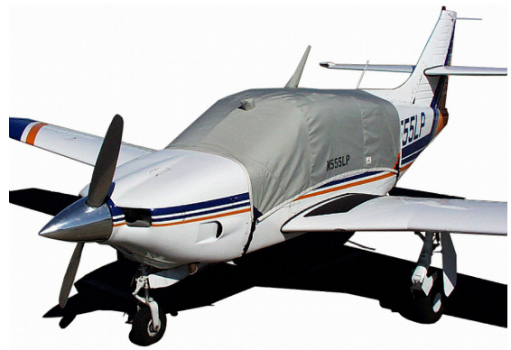
Standard Canopy cover for Rockwell 112/114 Models