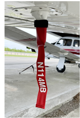
ENGINE PLUGS PREVENT BIRD NEST FOD. Piper Saratoga Engine Cowling Bird's Nest Rockwell 114 Blade Type Pitot Cover