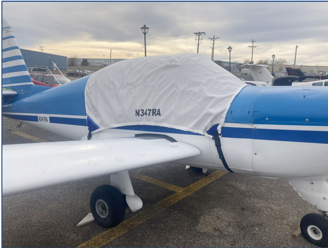
SOCATA Rallye 150 Canopy Cover