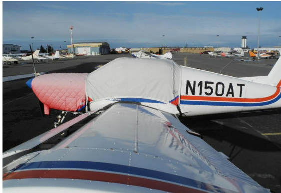
Koliber 150A Canopy Cover, Insulated Engine Cover

This cover type is made from Silver Acrylic Sunbrella canvas and is 100% lined with a soft and smooth microfiber. Bruce's Custom Covers developed this material combination especially for aircraft protection. The outer material is medium weight and treated for water resistance, UV resistance and anti-static buildup. The inner lining is a very soft and smooth microfiber to prevent scratching. The material is very reflective, and tests show that the cabin interior temperature can be reduced to near-ambient temperature on the hottest of days. It is water, ice and snow repellent, yet breathable to allow moisture to escape from between the cover and the aircraft surface.