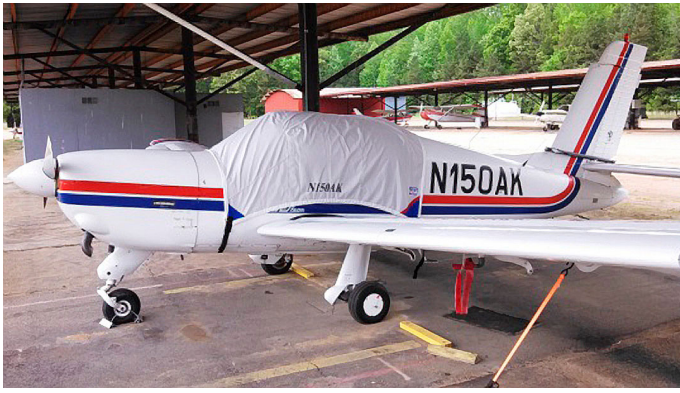
Rallye Canopy Cover