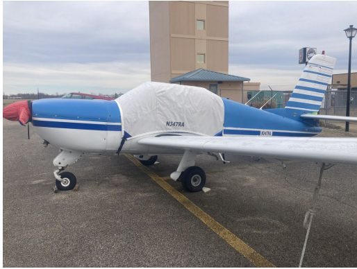
SOCATA Rallye 150 Canopy Cover, Prop Cover

The Aerospatiale (Socata) Rallye 150 Canopy/Engine Cover is a one-piece cover (100% lined with microfiber) that is a combination of the Canopy Cover and Engine Cover. This cover will enclose the engine cowl and will extend aft to cover all of the windows. This cover type is made from Silver Acrylic Sunbrella canvas and is 100% lined with a soft and smooth microfiber. Bruce's Custom Covers developed this material combination especially for aircraft protection. The outer material is medium weight and treated for water resistance, UV resistance and anti-static buildup. The inner lining is a very soft and smooth microfiber to prevent scratching. The material is very reflective, and tests show that the cabin interior temperature can be reduced to near-ambient temperature on the hottest of days. It is water, ice and snow repellent, yet breathable to allow moisture to escape from between the cover and the aircraft surface.