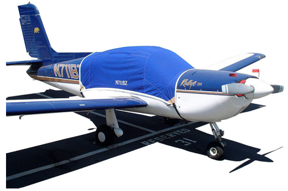
Rallye Canopy Cover