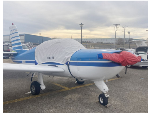
SOCATA Rallye 150 Canopy Cover, Prop Cover