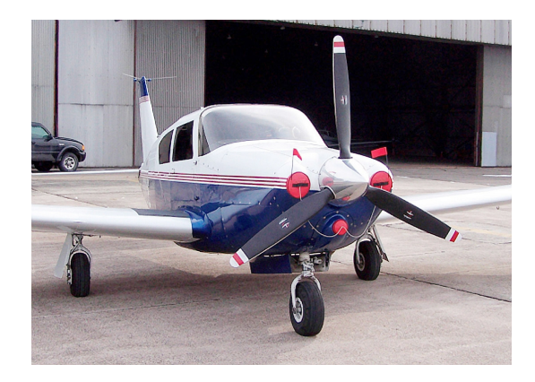
Piper Comanche Engine Plugs

Engine Inlet Plugs are custom fit for your Ravin 300 & 500 Models intakes, made with heavy-duty vinyl material, and stuffed with a single block of sculpted urethane foam. Each plug has a zipper that allows the foam to be removed and dried if necessary. Engine plugs have warning flags that are visible from the cockpit or 'remove before flight' streamers sewn onto the face of the plugs. Most plugs are imprinted with the aircraft registration number in black for an extra charge. Storage bag NOT included. Engine plugs may be inserted after flight when the engine is still warm. Engine Inlet Plugs are commonly referred to as Cowl Plugs, Intake Plugs, Cowl Blocks, Engine Blocks, and Engine Bungs.