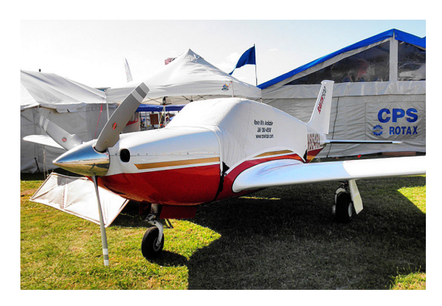
Ravin 500 Standard Canopy Cover

This cover type is made from Silver Acrylic Sunbrella canvas and is 100% lined with a soft and smooth microfiber. Bruce's Custom Covers developed this material combination especially for aircraft protection. The outer material is medium weight and treated for water resistance, UV resistance and anti-static buildup. The inner lining is a very soft and smooth microfiber to prevent scratching. The material is very reflective, and tests show that the cabin interior temperature can be reduced to near-ambient temperature on the hottest of days. It is water, ice and snow repellent, yet breathable to allow moisture to escape from between the cover and the aircraft surface.