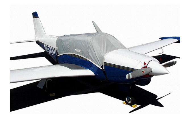
Piper Comanche Standard Canopy Cover & Engine Plugs