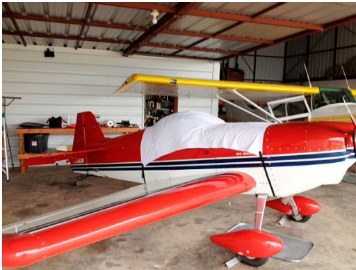
IAC One Design Canopy Cover, test fit cover

This cover type is made from Silver Acrylic Sunbrella canvas and is 100% lined with a soft and smooth microfiber. Bruce's Custom Covers developed this material combination especially for aircraft protection. The outer material is medium weight and treated for water resistance, UV resistance and anti-static buildup. The inner lining is a very soft and smooth microfiber to prevent scratching. The material is very reflective, and tests show that the cabin interior temperature can be reduced to near-ambient temperature on the hottest of days. It is water, ice and snow repellent, yet breathable to allow moisture to escape from between the cover and the aircraft surface.