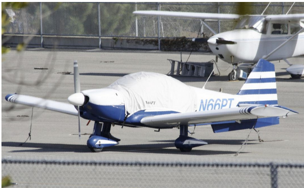
Robin R-2160 Canopy Cover with 12" forward Extension

This cover type is made from Silver Acrylic Sunbrella canvas and is 100% lined with a soft and smooth microfiber. Bruce's Custom Covers developed this material combination especially for aircraft protection. The outer material is medium weight and treated for water resistance, UV resistance and anti-static buildup. The inner lining is a very soft and smooth microfiber to prevent scratching. The material is very reflective, and tests show that the cabin interior temperature can be reduced to near-ambient temperature on the hottest of days. It is water, ice and snow repellent, yet breathable to allow moisture to escape from between the cover and the aircraft surface.