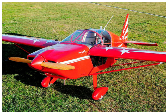
Covers, plugs & related items for the Rans S-10 Sakota